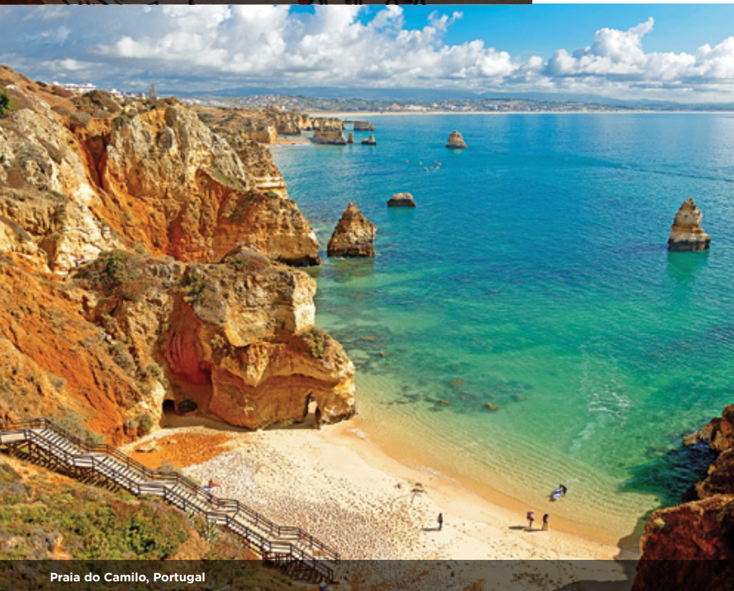
Praia do Camilo, Portugal