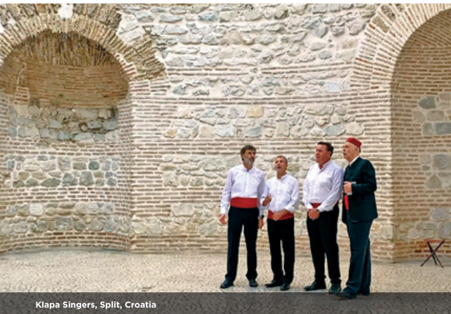
Klapa Singers, Split, Croatia