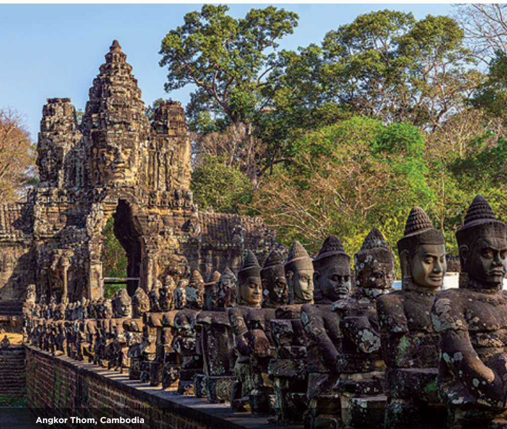
Angkor Thom, Cambodia