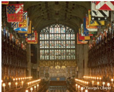
St George's Chapel

Travel with experienced Tour Directors, enjoy evening talks from expert guest speakers, stay in well-appointed hotels, discover living examples of Britain's past and indulge in flavorful regional cuisine as specified in each itinerary.