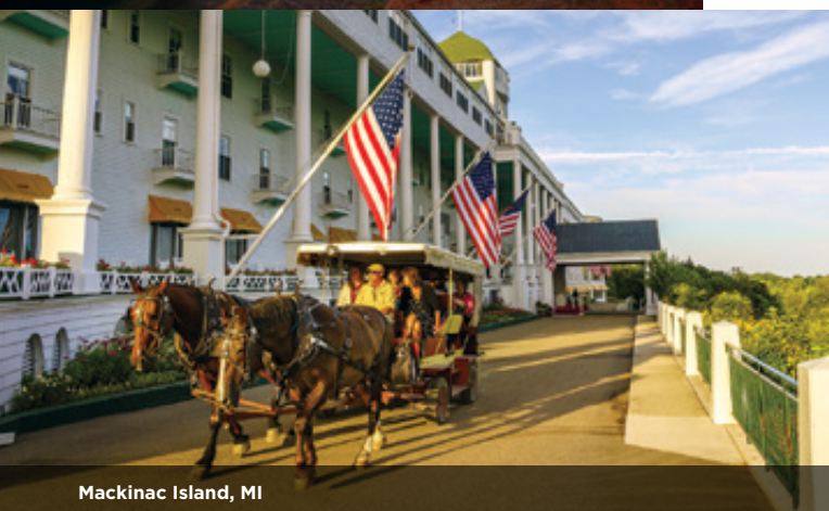
Mackinac Island, MI