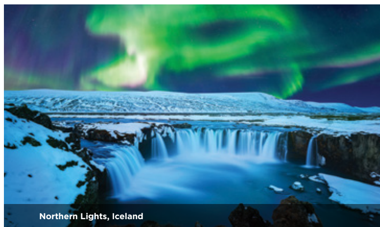
Northern Lights, Iceland