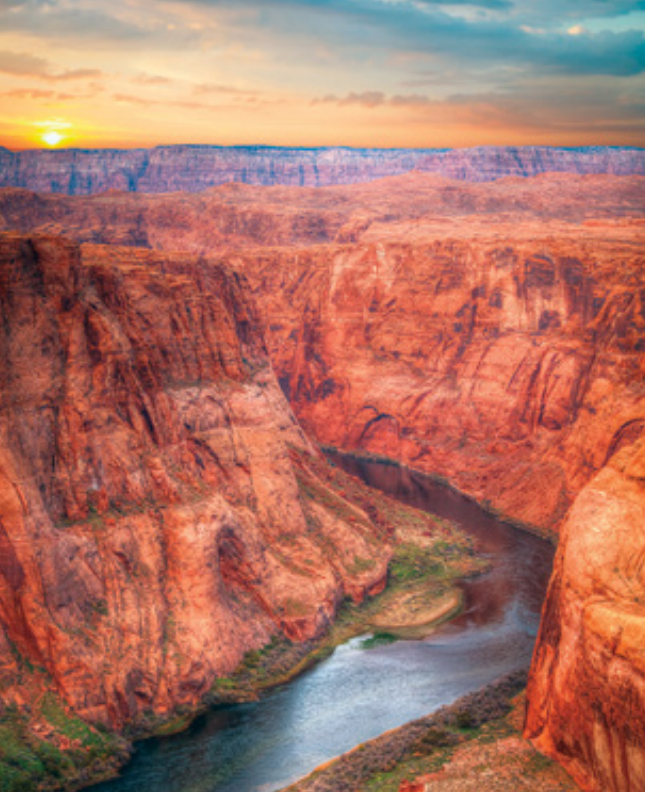
Grand Canyon, AZ