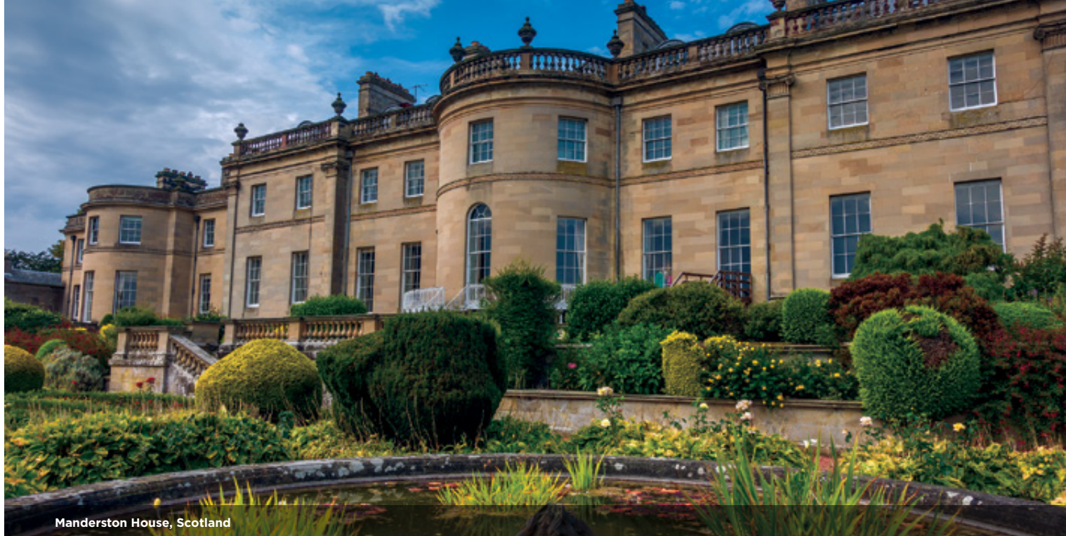
Manderston House, Scotland