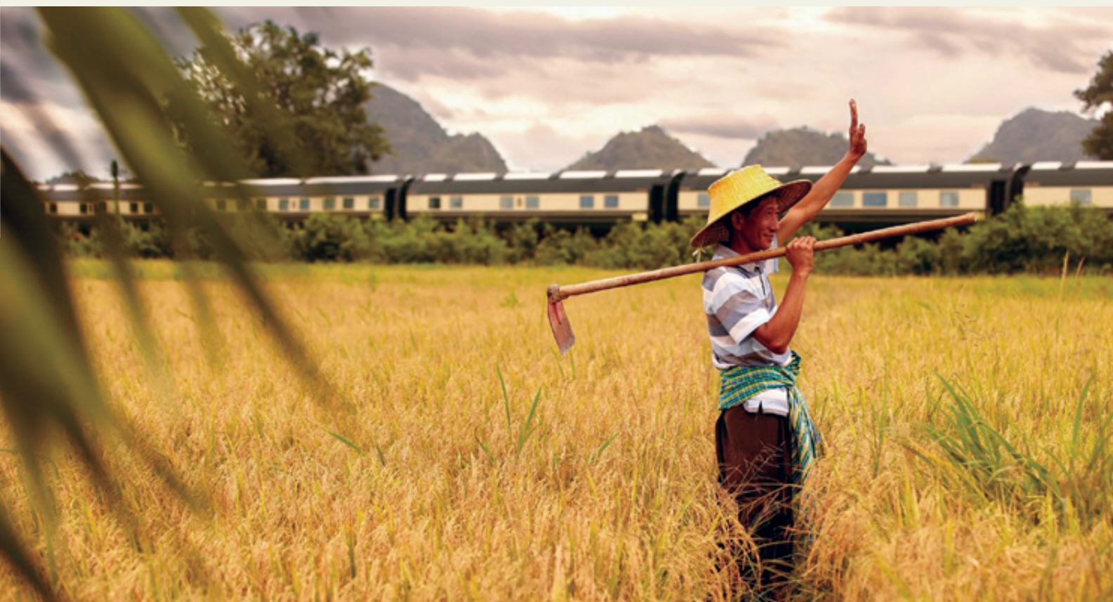
Eastern Oriental Express Train