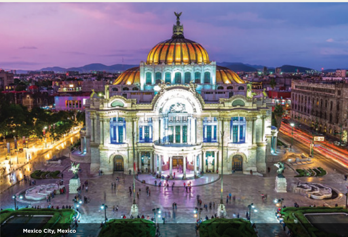
Mexico City, Mexico