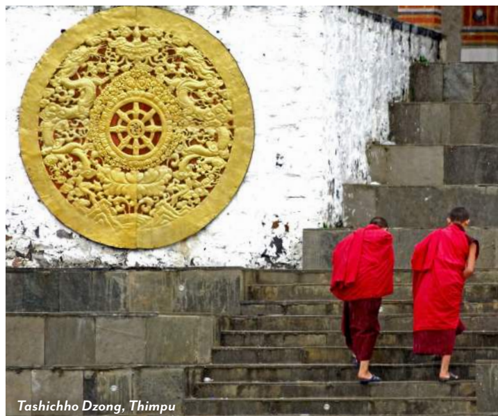
Tashichho Dzong, Thimpu

Bangkok | 5 days, 4 nights October 14 to 18, 2026 | Program Begins: October 16