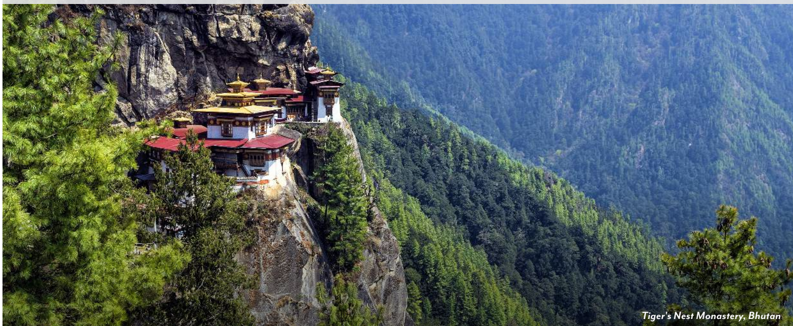
Tiger's Nest Monastery, Bhutan