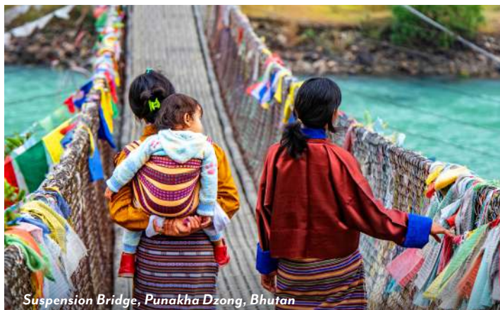
Suspension Bridge, Punakha Dzong, Bhutan

All Program Features are contingent upon final brochure pricing. 2026