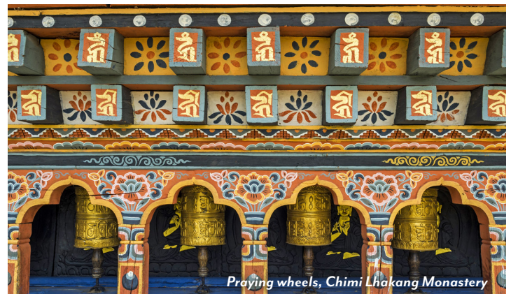
Praying wheels, Chimi Lhakang Monastery