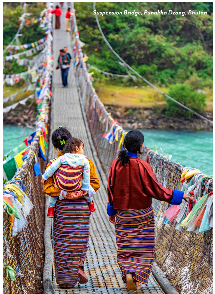
Suspension Bridge, Punakha Dzong, Bhutan