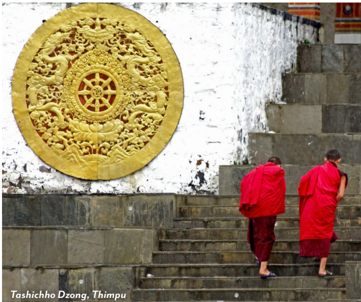
Tashichho Dzong, Thimpu