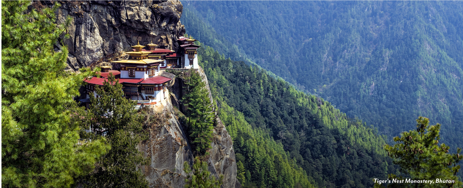
Tiger's Nest Monastery, Bhutan