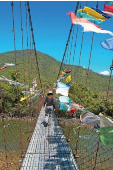
Pho Chhu Suspension Bridge, Punakha

This morning, hike to Khamsum Yulley Namgyal Chorten, standing proudly on a hilltop. Cross a thrilling suspension bridge draped with fluttering flags and ascend a narrow track up the hill. Upon reaching the chorten, marvel at the beautiful iconic shrine and soak up the views of the lush valley below — a uniquely peaceful experience. After