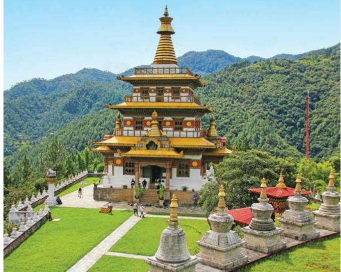
Khamsum Yulley Namgyal Chorten

to the seventh century. Visit Paro Rinpung Dzong, whose name translates to Fortress on a Heap of Jewels. Perched above the dzong a small distance away is its round, thick-walled watchtower, built as a defense in 1649. Some 300 years later, the watchtower was turned into the National Museum of Bhutan and filled with art and arcana that ranges from the quotidian to the surreal. Tour the museum and part of the fortress. Marvel at the stunning architecture and views. Spend the next three nights at the deluxe Le Meridien Paro .