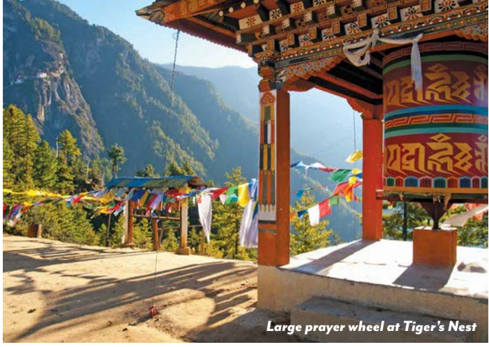
Large prayer wheel at Tiger's Nest

lunch, visit Punakha Dzong (Palace of Great Happiness), an iconic ancient fortress built in 1637 at the confluence of two rivers. Cross a famous landmark, the Pho Chhu Suspension Bridge. The swaying bridge is 525 feet long and draped with colorful prayer flags. As you stroll, take in the marvelous view of the fortress and the surrounding green landscape.