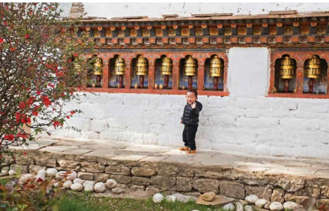
Prayer wheels at Kyichu Lhakhang

Note: This is an ACTIVE program. The itinerary is subject to change due to local conditions.