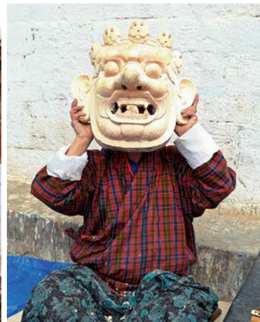
Craftsman showing his carving handiwork on a traditional dance mask