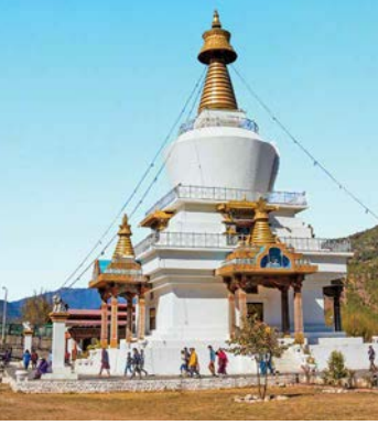
National Memorial Chorten

the hotel in Punakha this afternoon. Then attend a prayer ceremony at the striking Sangchen Dorji Lhuendrup Nunnery complex, perched on a ridge overlooking the scenic Punakha valley.