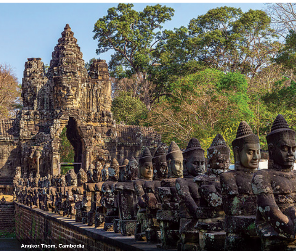
Angkor Thom, Cambodia