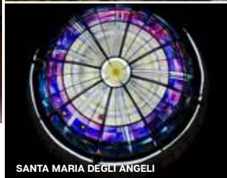
SANTA MARIA DEGLI ANGELI