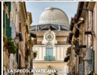
LA SPECOLA VATICANA