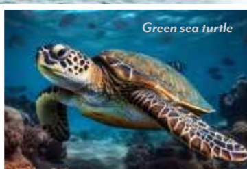
Green sea turtle

An astonishing vision of life without human presence, the Galápagos Islands represent a truly unique environment. Located six hundred miles off the coast of Ecuador, the archipelago's isolation combined with the nutrient-rich waters of the Humboldt Current have created one of the world's richest marine ecosystems. Darwin's "living laboratory," the Galápagos Islands spurred the naturalist's paradigm-shifting work, On the Origin of the Species . Published in 1859, his speculations on natural selection in the role of "aboriginal creations, found nowhere else," inspired one of the most revolutionary scientific theories in history. One of the first and most treasured UNESCO World Heritage Sites, the Galápagos sustains an astounding number of endemic species that continue to thrive with the absence of natural predators.