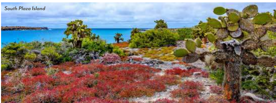
South Plaza Island

rocks below. After lunch on board, spend this afternoon on a walk, then a kayak or glass bottom boat ride, spotting an array of colorful and unique wildlife—on the land and in the water! Tonight, join your fellow passengers for the Captain's Farewell Reception on the