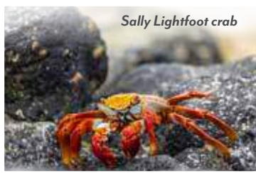
Sally Lightfoot crab