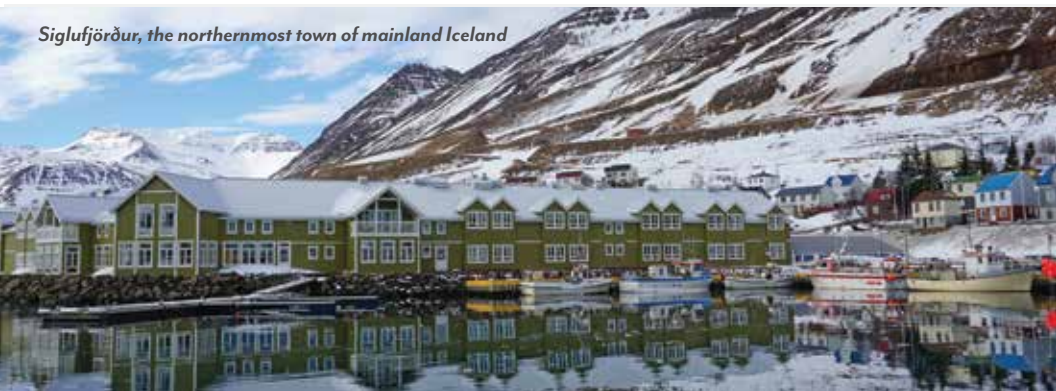
Siglufjörður, the northernmost town of mainland Iceland

Transfer to the airport for your flight back to your home city. (B)