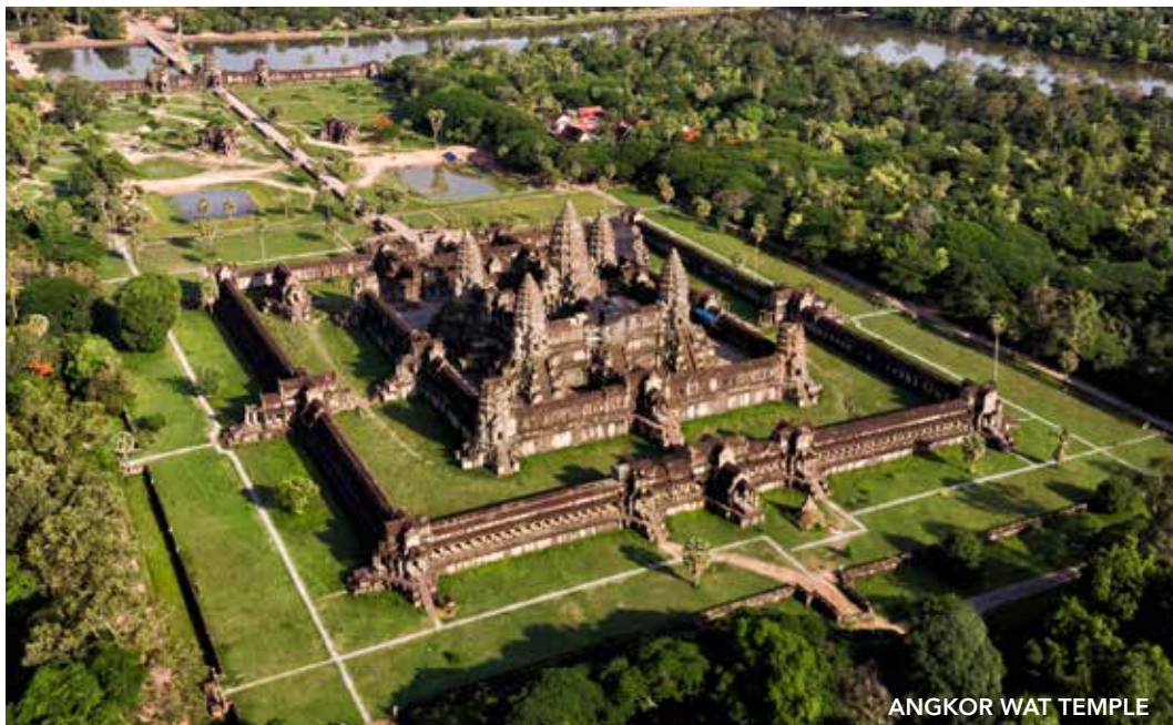
ANGKOR WAT TEMPLE

Overnight: Sofitel Legend Metropole (B,L,D)