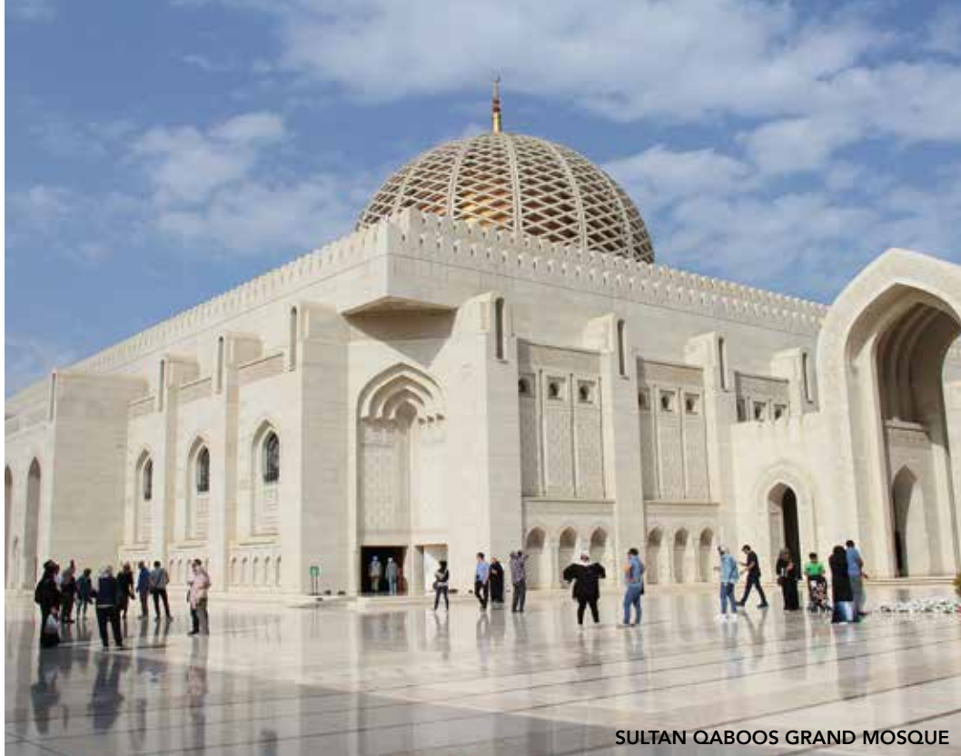
SULTAN QABOOS GRAND MOSQUE

See the ancient Omani architecture designed over two levels and the surrounding plantations of green date palms. Ascend to the top of the fort for panoramic views of the Hajar Mountains. The structure also hosts a museum that exhibits how Omanis lived in ancient times.