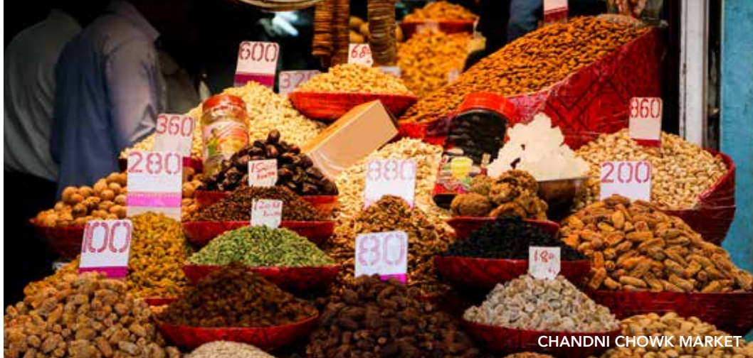
CHANDNI CHOWK MARKET