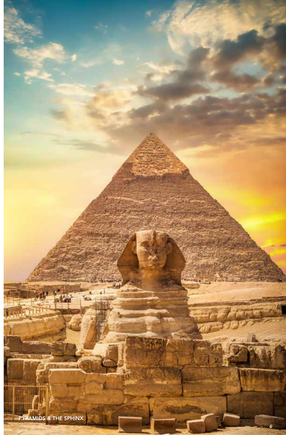
PYRAMIDS & THE SPHINX

Overnight: Marriott Mena House – Cairo (B,L,D)