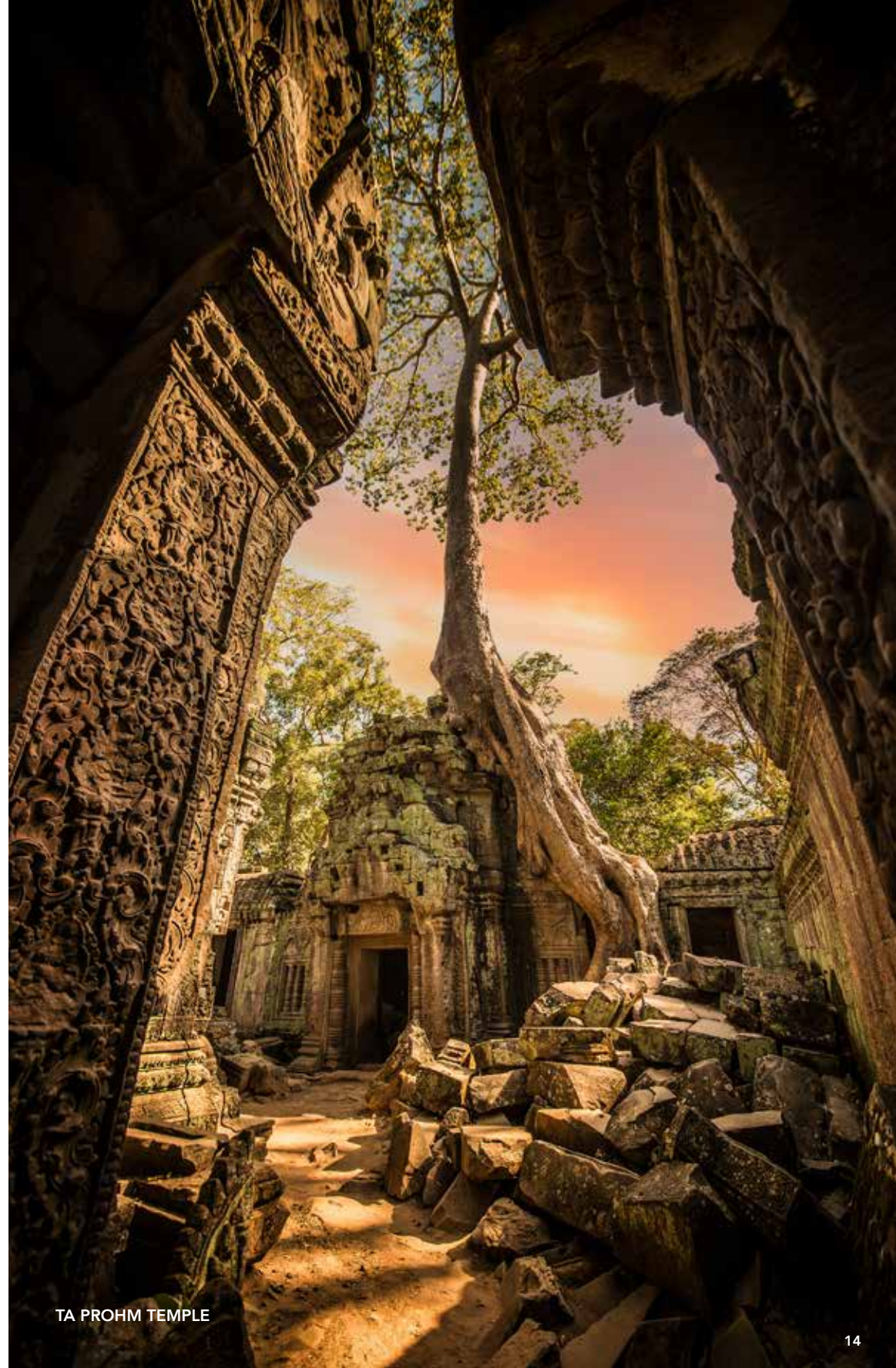
TA PROHM TEMPLE