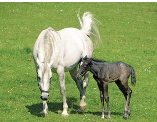
Lippizaner mother & foal

Free Time: Explore the area a bit and choose among the wide selection of restaurants in Salzburg, from refined contemporary or classical Austrian cuisines to casual fare at a café or beer garden.