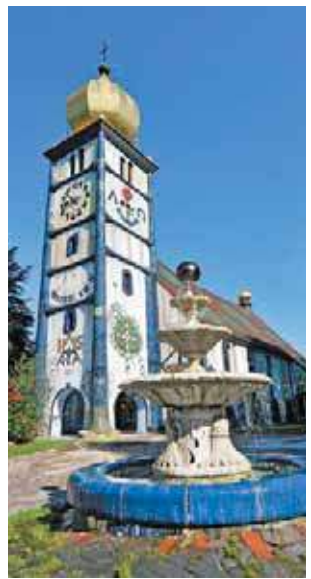
St. Barbara Church, Bärnbach