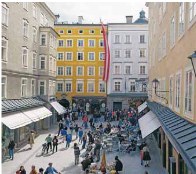
Mozart's Birthplace, Salzburg