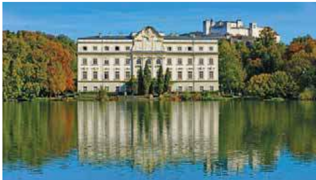
Leopoldskron Palace, one of the filming locations of "The Sound of Music"