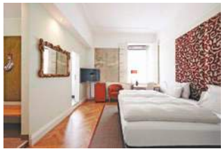
Hotel Weitzer | Graz