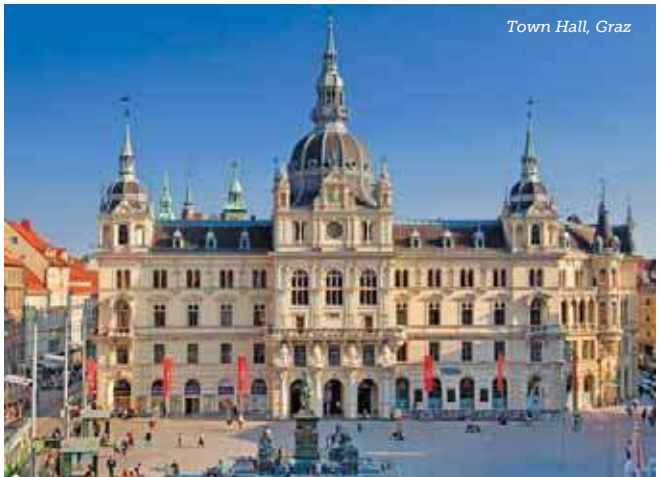
Town Hall, Graz