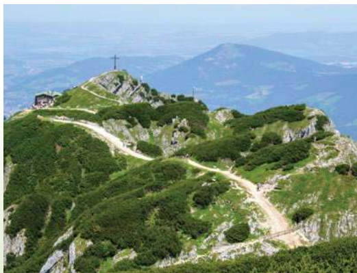
Eagle's Nest, Mount Kehlstein

Hohensalzburg Fortress. Visit the largest fully preserved castle in Central Europe, perched high above the rooftops, to admire panoramic views of the city from Hohensalzburg Fortress.