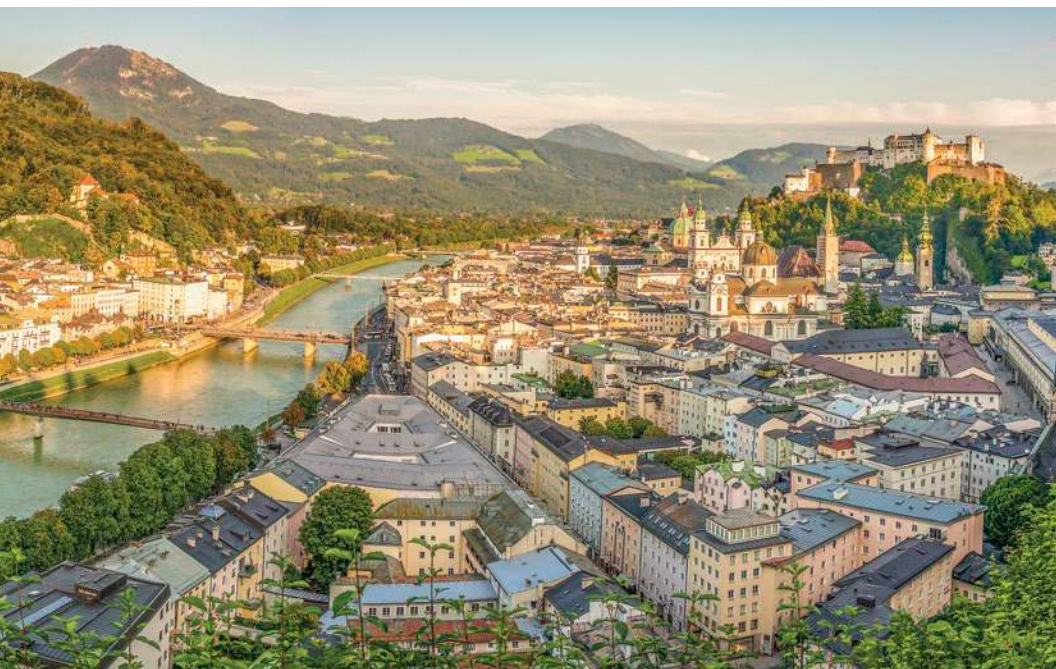
Hohensalzburg Fortress perched above the city of Salzburg