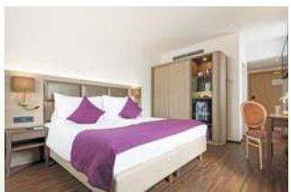
Imlauer Hotel Pitter Salzburg | Salzburg