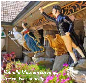
Valhalla Museum carvings, Tresco, Isles of Scilly

The seaside town of Cowes on the Isle of Wight is a festive harbor town known for its yachting culture and sailing races. Along with a lovely Parade and Esplanade, Cowes boasts a charming High Street filled with boutiques, galleries and restaurants (it is rumored that Cowes has more eateries per square mile than any other town in the U.K.!). More famously, Cowes is home to Osborne House, Queen Victoria's beloved vacation home. "It's hard to imagine a lovelier spot," the queen proclaimed. Yet many international travelers have not been here. And what about Tresco, on the Isles of Scilly? One of the first surprises about Tresco is that, even though it is situated off the chilly coast of Cornwall, it supports a subtropical garden filled with exotic plants, many of which bloom all year. Tour this lush parkland, built around a crumbling 11th-century abbey, and marvel at the thousands of plants. Another surprise? The Valhalla Museum located within the gardens, home to figureheads and other ships' carvings salvaged from area shipwrecks since 1840. These surprising delights — as well as many other lovely adventures — await you as you tour the British and Emerald Isles!