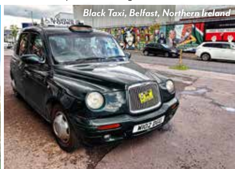
Black Taxi, Belfast, Northern Ireland