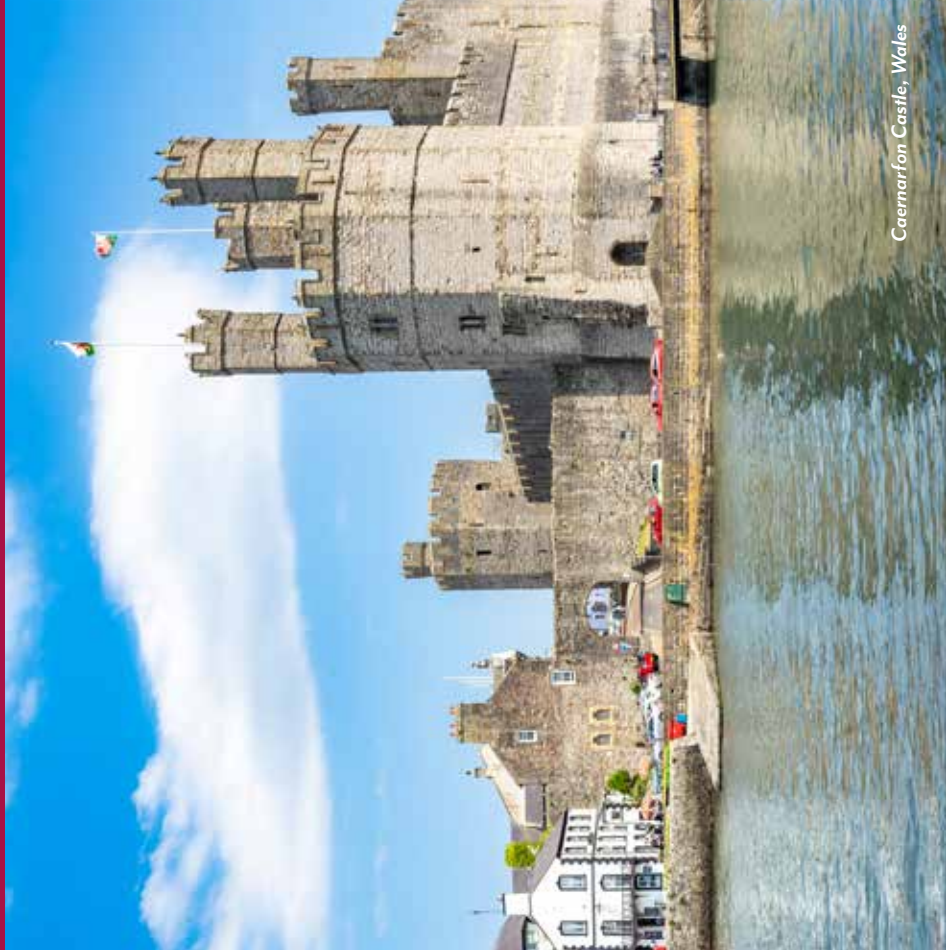
Caernarfon Castle, Wales

PRSR1 STD U.S. Postage PAID Gohagan & Company