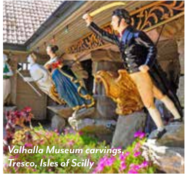
Valhalla Museum carvings, Tresco, Isles of Scilly

The seaside town of Cowes on the Isle of Wight is a festive harbor town known for its yachting culture and sailing races. Along with a lovely Parade and Esplanade, Cowes boasts a charming High Street filled with boutiques, galleries and restaurants (it is rumored that Cowes has more eateries per square mile than any other town in the U.K.!). More famously, Cowes is home to Osborne House, Queen Victoria's beloved vacation home. "It's hard to imagine a lovelier spot," the queen proclaimed. Yet many international travelers have not been here. And what about Tresco, on the Isles of Scilly? One of the first surprises about Tresco is that, even though it is situated off the chilly coast of Cornwall, it supports a subtropical garden filled with exotic plants, many of which bloom all year. Tour this lush parkland, built around a crumbling 11th-century abbey, and marvel at the thousands of plants. Another surprise? The Valhalla Museum located within the gardens, home to figureheads and other ships' carvings salvaged from area shipwrecks since 1840. These surprising delights — as well as many other lovely adventures — await you as you tour the British and Emerald Isles!