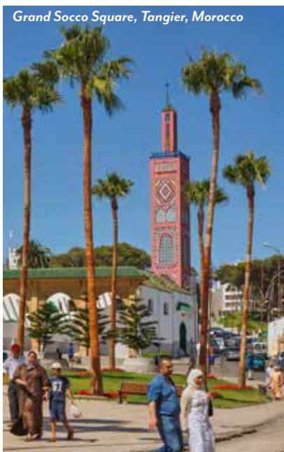
Grand Socco Square, Tangier, Morocco

Nothing evokes mystery and intrigue quite like Morocco, a multicultural nation rich in royal tradition, delectable food and exquisite architectural treasures. Located directly across the Strait of Gibraltar from Spain, it is the land of colorful souks and lively medinas, mighty mosques and grand palaces. Our journey begins with one night in the UNESCO-designated, Moroccan capital city of Rabat — setting the scene for the tapestry of stories that await as you cruise from cosmopolitan Casablanca to the Andalusian coast of Spain and on to the Iberian Peninsula. Trace the rise and fall of ancient empires that conquered cities in this region, weaving a vibrant mosaic of art, religion and culture. This confluence and collaboration also ushered in advances in mathematics, science, medicine, horticulture and philosophy — sparking the catalyst for global trade at the crossroads of Africa and Europe that would ultimately change the world.