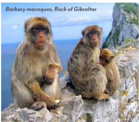
Barbary macaques, Rock of Gibraltar