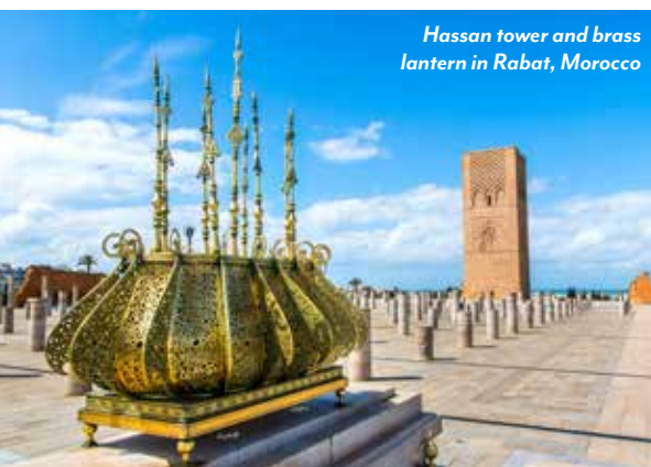
Hassan tower and brass lantern in Rabat, Morocco

The Rock of Gibraltar was considered by the ancient Greeks and Romans to be one of the two Pillars of Hercules that marked the boundary of the known world. You will have the option to walk up a steep road to stand on the "Top of the Rock" — a nearly