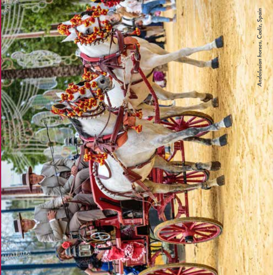
Andalusian horses, Cadiz, Spain

Early Booking Savings* available | Save $2,000 per couple!