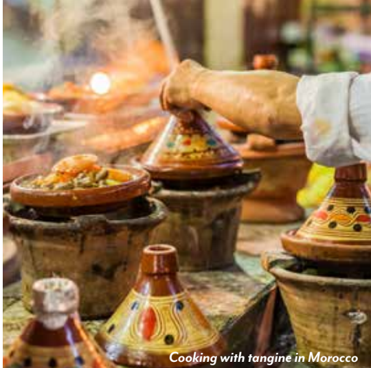
Cooking with tagine in Morocco

1,400-foot-high limestone promontory — and enjoy an expansive view across the strait separating Europe and Africa. From there, you'll explore the impressive stalagmites and stalactites in St. Michael's Cave and see the amusing antics of Barbary macaques, the only colony of wild monkeys in Europe. The tour concludes with a visit to the Great Siege Tunnels, excavated by British Army engineers in the late 18th century to provide defense for the colony. (B,L,D)