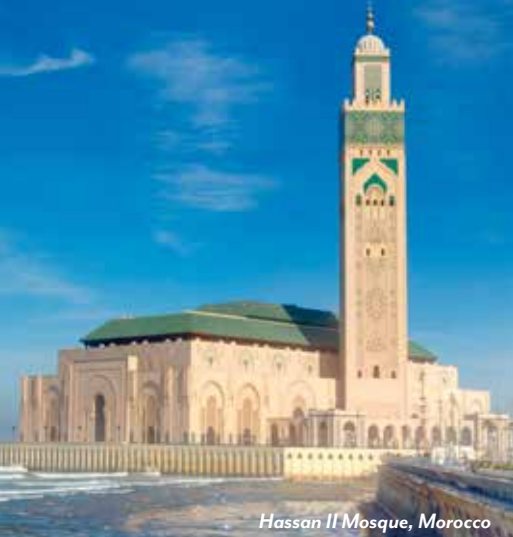
Hassan II Mosque, Morocco