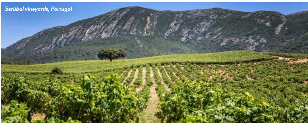
Setúbal vineyards, Portugal

Arrive in Lisbon and transfer to the airport for your flight back to your home city. (B)