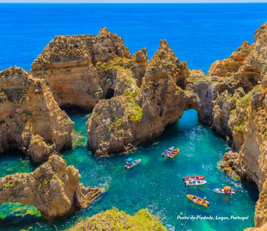
Ponta da Piedade, Lagos, Portugal

Front cover: Hassan II Mosque in Casablanca, Morocco