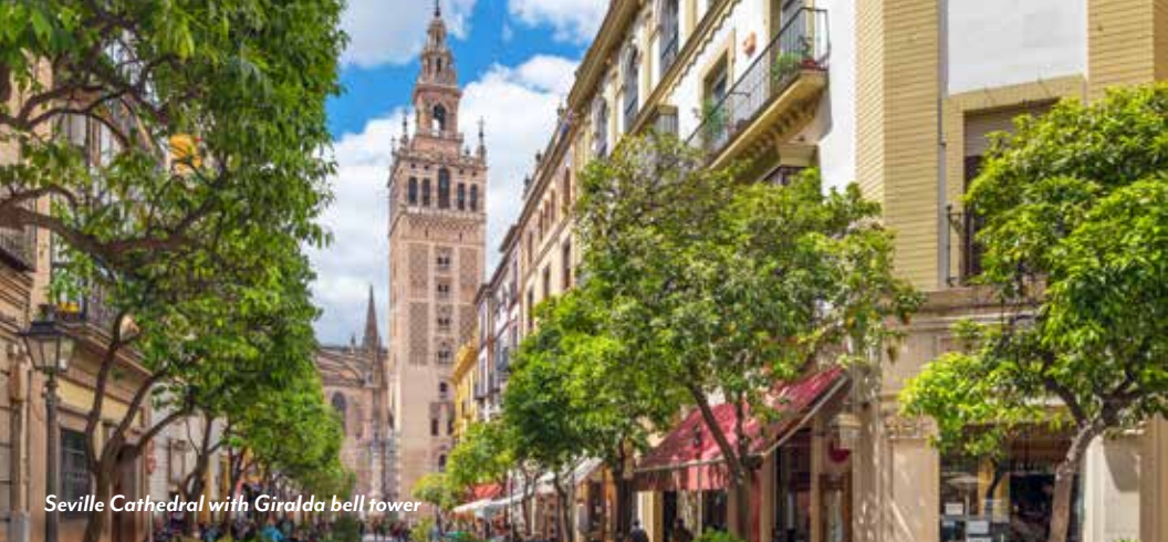
Seville Cathedral with Giralda bell tower