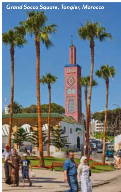
Grand Socco Square, Tangier, Morocco

Nothing evokes mystery and intrigue quite like Morocco, a multicultural nation rich in royal tradition, delectable food and exquisite architectural treasures. Located directly across the Strait of Gibraltar from Spain, it is the land of colorful souks and lively medinas, mighty mosques and grand palaces. Our journey begins with one night in the UNESCO-designated, Moroccan capital city of Rabat — setting the scene for the tapestry of stories that await as you cruise from cosmopolitan Casablanca to the Andalusian coast of Spain and on to the Iberian Peninsula. Trace the rise and fall of ancient empires that conquered cities in this region, weaving a vibrant mosaic of art, religion and culture. This confluence and collaboration also ushered in advances in mathematics, science, medicine, horticulture and philosophy — sparking the catalyst for global trade at the crossroads of Africa and Europe that would ultimately change the world.