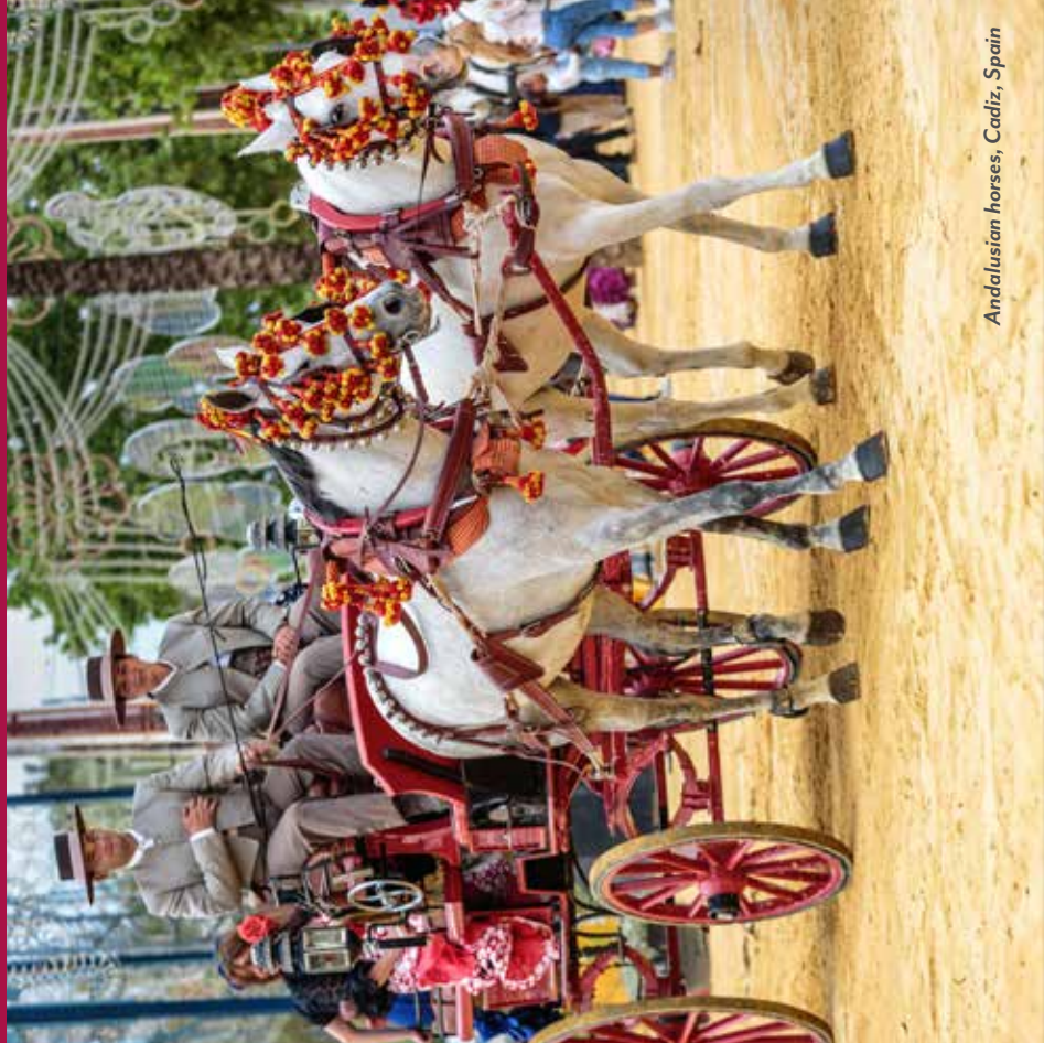
Andalusian horses, Cadiz, Spain

Early Booking Savings* available | Save $2,000 per couple!