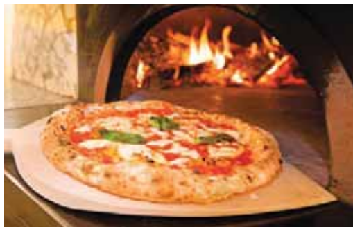
Above: Neapolitan pizza | Below: Olive oil & cheese