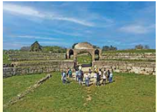
Below: Amphitheater, Paestum | Above: Amalfi

Energetic Naples, the capital city of Campania, welcomes visitors with a vivacious spirit. Gain insight into the ancient world at the Museo Archeologico Nazionale. The museum's galleries boast one of the largest collections of Greco-Roman artifacts in the world. Continue on a panoramic tour of Naples, taking in sprawling views of the city and the Bay of Naples from atop Posillipo Hill. Note the landmarks of Castel