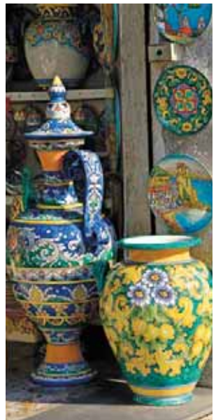
Pottery, Vietri sul Mare

Knowledgeable Lecturers deepen your appreciation for the region and its history, culture and current events.