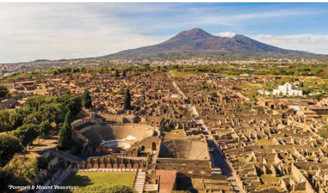
Pompeii & Mount Vesuvius

Nuovo, San Francesco di Paola, Teatro di San Carlo and Piazza del Plebiscito.