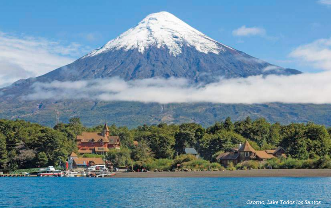
Osorno, Lake Todos los Santos