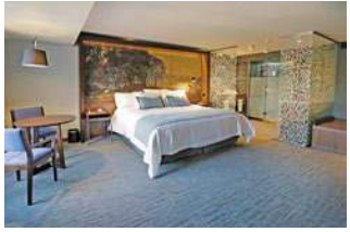
Hotel Cumbres Lastarria | Santiago