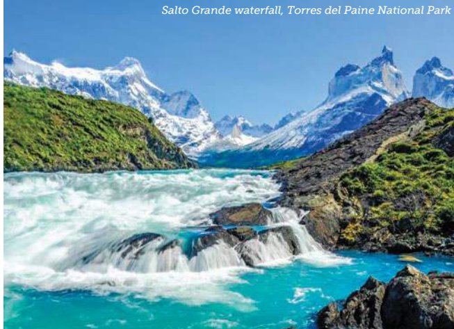
Salto Grande waterfall, Torres del Paine National Park