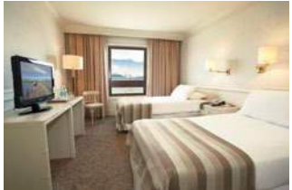
Hotel Costaustralis | Puerto Natales