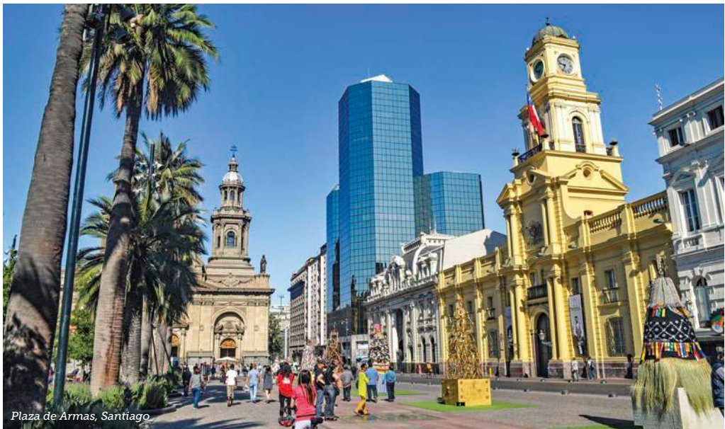
Plaza de Armas, Santiago