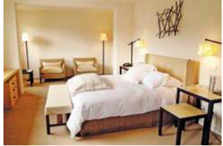
Enjoy Puerto Varas Hotel | Puerto Varas