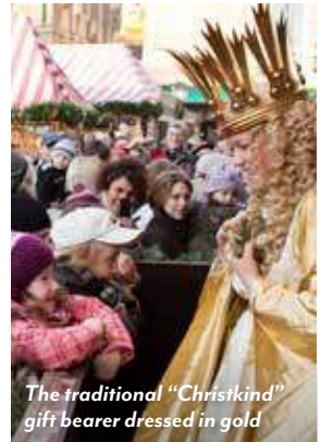
The traditional “Christkind” gift bearer dressed in gold

The concept of an open-air fair during December dates to 13th-century Vienna, when Duke Albrecht I granted permission for a market that would allow townspeople to gather supplies for the winter ahead. While historians say there is no evidence that this medieval market had any connection to religion, the popularity of the wintermärkte spread through German-speaking regions during the Middle Ages. By the 16th and 17th centuries, as festive Christmas celebrations became more commonplace in Austria and Germany, the winter market evolved into the more elaborate spectacle now known as the Christkindlmärkte — which translates to “Christ child market.” Delectable treats, handcrafted nutcrackers, wood carvings and other ornaments began to fill the market stalls. Nuremberg’s lovely Christkindlesmarkt, which you will visit, has been operating since at least 1628. In addition to Old-World Christmas decorations, the market is renowned for preserving the city’s famous rostbratwurst and the 17th-century lebkuchen gingerbread. Today, these centuries-old Christmas traditions continue in markets throughout Europe, which charm visitors with sparkling lights, fresh pine boughs, roasted chestnuts, mugs of glühwein and the merry sounds of carolers.