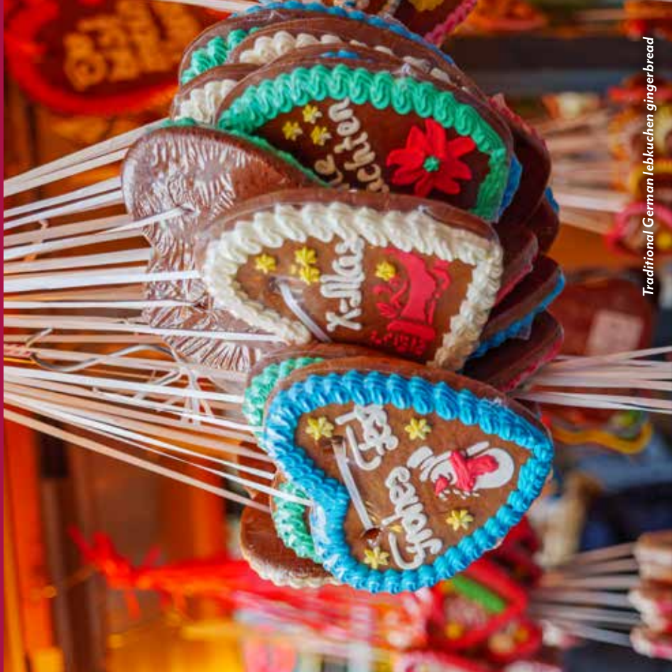
Traditional German lebkuchen gingerbread

PRSRT STD U.S. Postage PAID Gohagan & Company