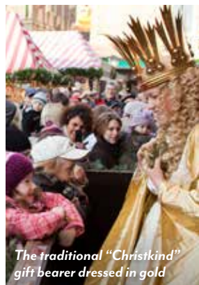
The traditional “Christkind” gift bearer dressed in gold

The concept of an open-air fair during December dates to 13th-century Vienna, when Duke Albrecht I granted permission for a market that would allow townspeople to gather supplies for the winter ahead. While historians say there is no evidence that this medieval market had any connection to religion, the popularity of the wintermärkte spread through German-speaking regions during the Middle Ages. By the 16th and 17th centuries, as festive Christmas celebrations became more commonplace in Austria and Germany, the winter market evolved into the more elaborate spectacle now known as the Christkindlmärkte — which translates to “Christ child market.” Delectable treats, handcrafted nutcrackers, wood carvings and other ornaments began to fill the market stalls. Nuremberg’s lovely Christkindlesmarkt, which you will visit, has been operating since at least 1628. In addition to Old-World Christmas decorations, the market is renowned for preserving the city’s famous rostbratwurst and the 17th-century lebkuchen gingerbread. Today, these centuries-old Christmas traditions continue in markets throughout Europe, which charm visitors with sparkling lights, fresh pine boughs, roasted chestnuts, mugs of glühwein and the merry sounds of carolers.