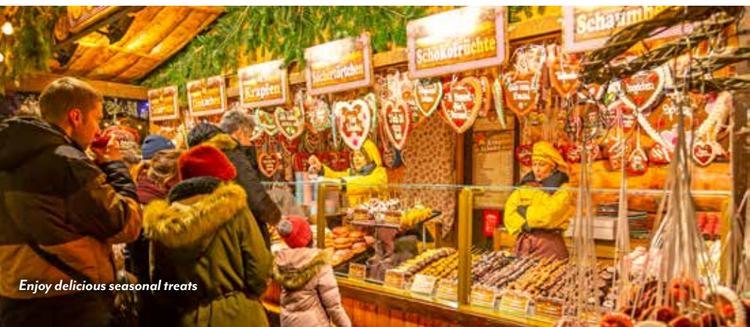
Enjoy delicious seasonal treats

The Dec. 8 departure operates in the reverse direction.