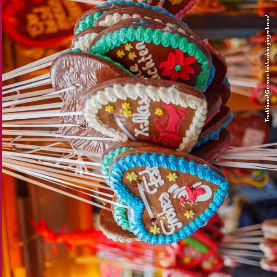
Traditional German Lebkuchen gingerbread

PRSR1 STD U.S. Postage PAID Gohagan & Company