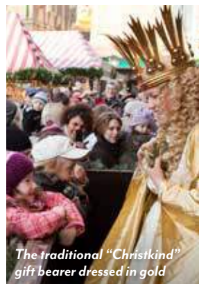
The traditional “Christkind” gift bearer dressed in gold

The concept of an open-air fair during December dates to 13th-century Vienna, when Duke Albrecht I granted permission for a market that would allow townspeople to gather supplies for the winter ahead. While historians say there is no evidence that this medieval market had any connection to religion, the popularity of the wintermärkte spread through German-speaking regions during the Middle Ages. By the 16th and 17th centuries, as festive Christmas celebrations became more commonplace in Austria and Germany, the winter market evolved into the more elaborate spectacle now known as the Christkindlmärkte — which translates to “Christ child market.” Delectable treats, handcrafted nutcrackers, wood carvings and other ornaments began to fill the market stalls. Nuremberg’s lovely Christkindlesmarkt, which you will visit, has been operating since at least 1628. In addition to Old-World Christmas decorations, the market is renowned for preserving the city’s famous rostbratwurst and the 17th-century lebkuchen gingerbread. Today, these centuries-old Christmas traditions continue in markets throughout Europe, which charm visitors with sparkling lights, fresh pine boughs, roasted chestnuts, mugs of glühwein and the merry sounds of carolers.