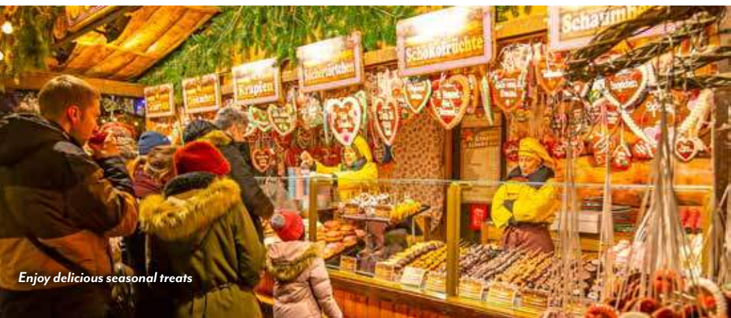
Enjoy delicious seasonal treats

The Dec. 8 departure operates in the reverse direction.