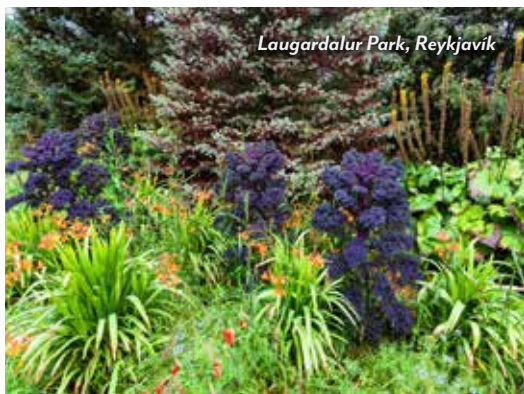
Laugardalur Park, Reykjavík