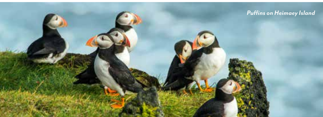
Puffins on Heimaey Island

Return to the ship for lunch and cruise to Grimsey Island, which straddles the top of the world at 66 degrees north. Enjoy a view of the Arctic Circle during a short walk. (B,L,D)