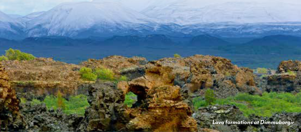
Lava formations at Dimmuborgir

A land of unparalleled geological riches, Iceland is home to 4,500 square miles of glaciers, 30 active volcanic systems, 800 hot springs and more than 10,000 waterfalls. Born of the monumental forces unleashed during the movement of the North American and Eurasian tectonic plates and carved out by formidable glaciers and incredible waterfalls, the land is a combination of intense natural energy and veritable calm. The topography of Iceland continues to evolve, yet many of its landscapes remain nearly unchanged since the first Viking settlers laid eyes on them more than 1,100 years ago. During your cruise you will see volcanic craters and fissures, watch as bubbling hot springs erupt steam into the air against a backdrop of Mars-like terrain, encounter pristine waterfalls and black lava deserts, and witness the stoic majesty of mountains capped with snow and volcanoes slumbering beneath sheets of ice. Along the coast, Iceland's characteristic fjords chronicle the powerful path of the glaciers. Enjoy these natural wonders, in constant flux as glaciers calve and shift and new mountains emerge from volcanic lava flow. A startlingly beautiful portrait of Earth's history and progress, Iceland is a primordial landscape hewn by the forces of fire and ice.