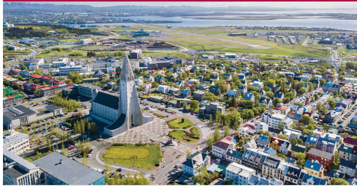
Reykjavík | 3 days, 2 nights Blue Lagoon | Reykjavík Tour | Þingvellir National Park