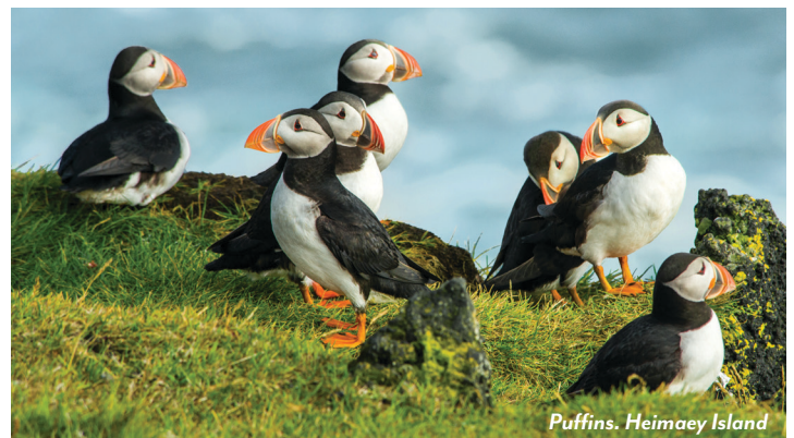
Puffins. Heimaey Island