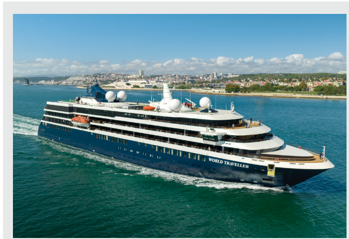
World Traveller Exclusively Chartered, Deluxe Small Ship