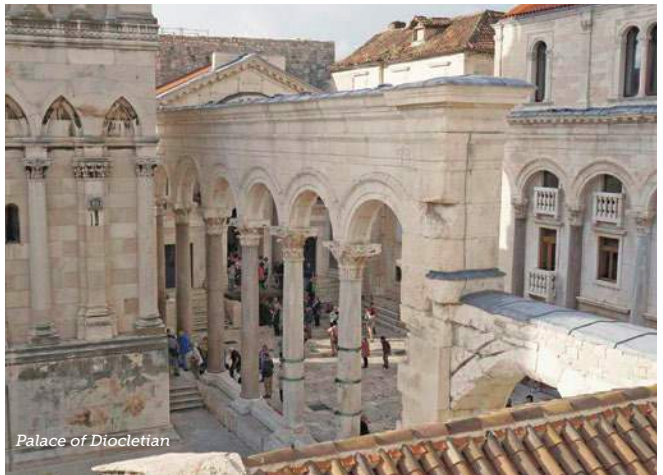
Palace of Diocletian