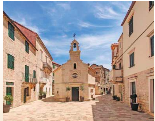
Stari Grad, Hvar

Šibenik. Šibenik is a proud city that welcomes visitors with lovely alleys, squares and striking