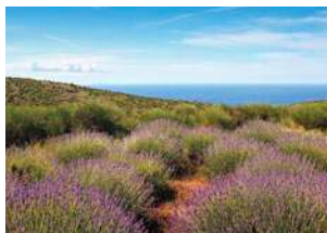
Lavender farm, Hvar