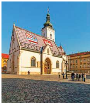
St. Mark's Church, Zagreb

Knowledgeable Lecturers deepen your appreciation for the region and its history, culture and current events.