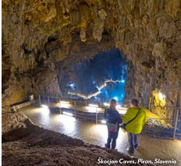
Škocjan Caves, Piran, Slovenia

Golden Gate and Silver Gate; along with Peristyle Square. Return to the ship to delight in a traditional klapa folk music performance. (B,L,D)