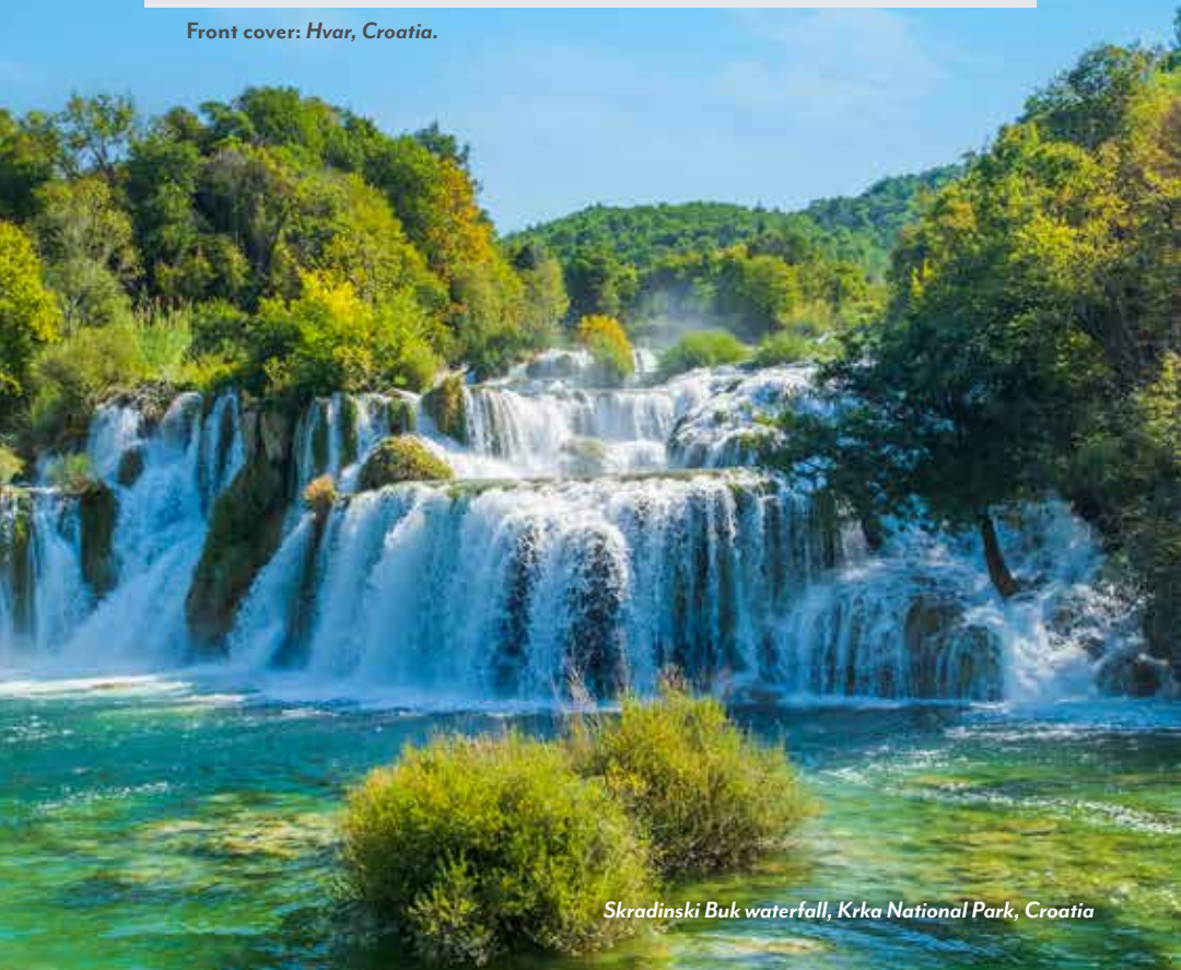
Skradinski Buk waterfall, Krka National Park, Croatia