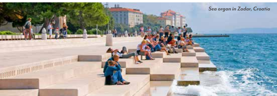
Sea organ in Zadar, Croatia

The glorious Dalmatian Coast has a remarkable history that can be traced back to the conquests of the Greeks and the Romans. The name “Dalmatia” appeared as early as the first-century B.C., believed to have originated from an ancient Illyrian tribe known as Delmatae . The region fell under many rulers over the centuries and today is considered one of the most majestic coastlines in the world. From the spectacular waterfalls of Krka National Park to the UNESCO-designated Škocjan Caves, natural splendor and lush landscapes only accentuate its allure. You can even hear the sounds of the Adriatic amplified by the 35-pipe sea organ that’s carved into the seafront promenade in Zadar. These storied cities have been infused with a cosmopolitan energy, inviting visitors to discover mysterious origins that span millennia. Among those enigmas is the tale of one of the earliest known depictions of a dog in an early 17th-century painting found in a Dalmatia city — a breed the World Canine Association aptly designated as the Dalmatian.