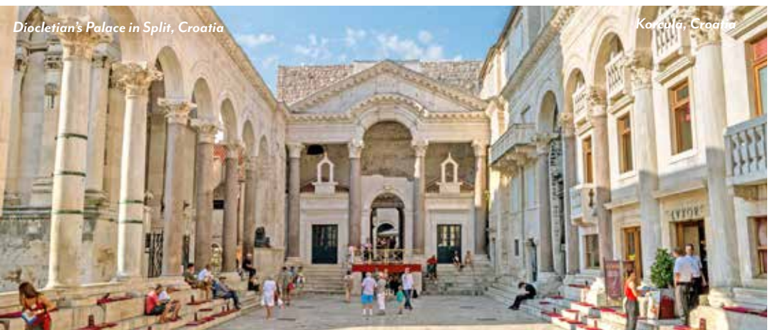
Diocletian's Palace in Split, Croatia

After lunch, return to Split for a walking tour of a nearly 2,000-year-old city center built around Roman emperor Diocletian's fourth-century palace compound, a UNESCO World Heritage site. Tour the palace, including Diocletian's mausoleum, converted to the Cathedral of Saint Domnius and regarded as the world's oldest Catholic cathedral. Then, visit the Cathedral of St. Dujé, the patron saint of Split: and the Temple of Jupiter. See two of the four principal Roman gates: