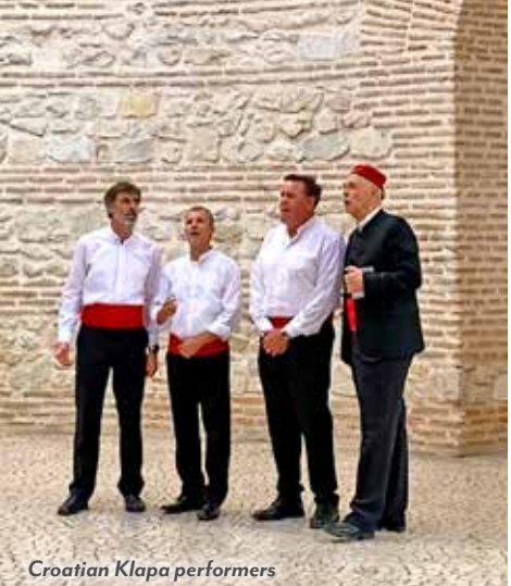
Croatian Klapa performers