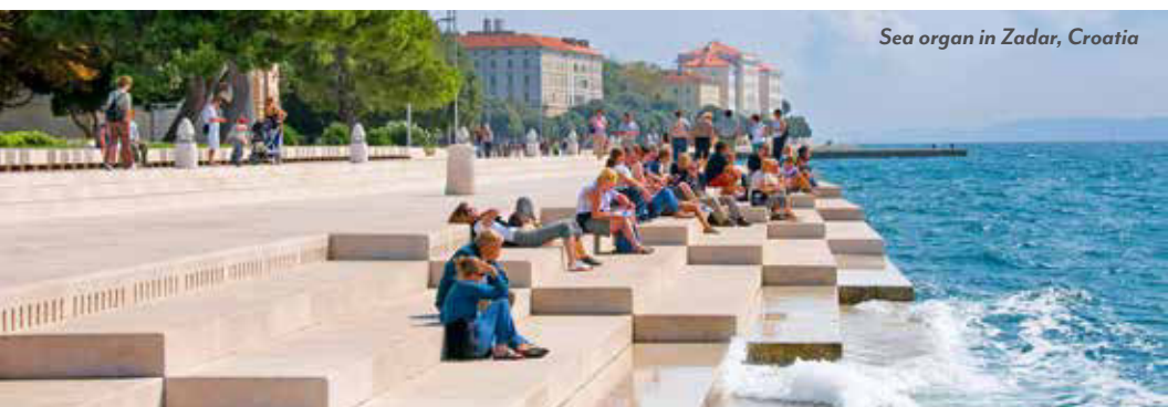
Sea organ in Zadar, Croatia

The glorious Dalmatian Coast has a remarkable history that can be traced back to the conquests of the Greeks and the Romans. The name “Dalmatia” appeared as early as the first-century B.C., believed to have originated from an ancient Illyrian tribe known as Delmatae . The region fell under many rulers over the centuries and today is considered one of the most majestic coastlines in the world. From the spectacular waterfalls of Krka National Park to the UNESCO-designated Škocjan Caves, natural splendor and lush landscapes only accentuate its allure. You can even hear the sounds of the Adriatic amplified by the 35-pipe sea organ that’s carved into the seafront promenade in Zadar. These storied cities have been infused with a cosmopolitan energy, inviting visitors to discover mysterious origins that span millennia. Among those enigmas is the tale of one of the earliest known depictions of a dog in an early 17th-century painting found in a Dalmatia city — a breed the World Canine Association aptly designated as the Dalmatian.