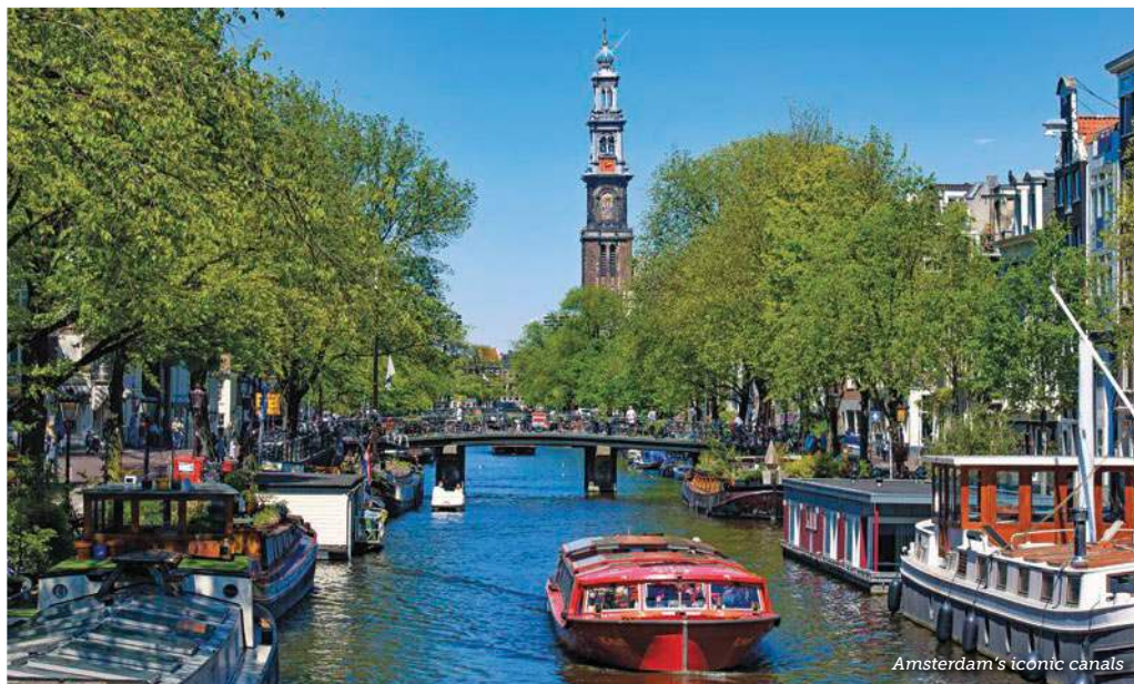
Amsterdam's iconic canals