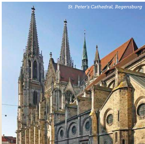
St. Peter's Cathedral, Regensburg