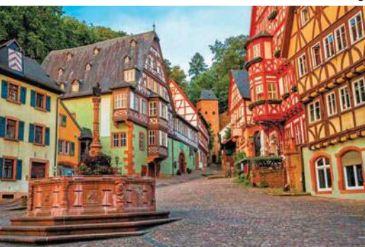
Half-timbered homes, Miltenberg