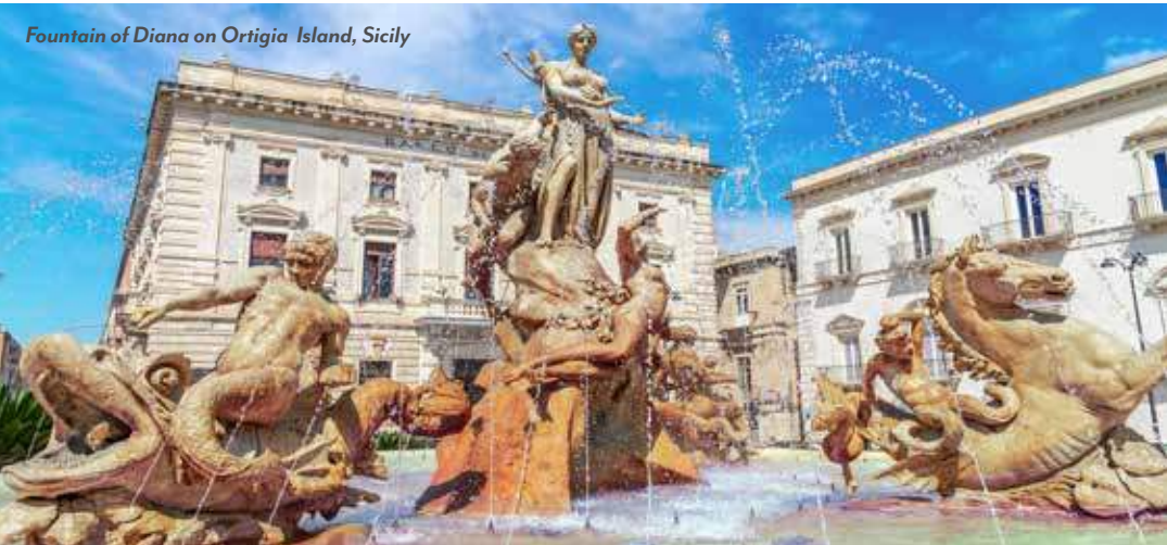
Fountain of Diana on Ortigia Island, Sicily

Visit Palermo's Baroque square and the 12th-century Duomo of Cefalù cathedral. Step inside the Palatine Chapel, a 12th-century masterpiece that reflects Sicily's diverse origins with European, Sicilian, Byzantine and Arab influences. At the Capo market, see revered Palermo street food and admire colorful stalls. After a tasting nearby, visit the UNESCO-designated Cathedral of Monreale — one of the greatest examples of Norman architecture and known for its Byzantine mosaics. (B,D)