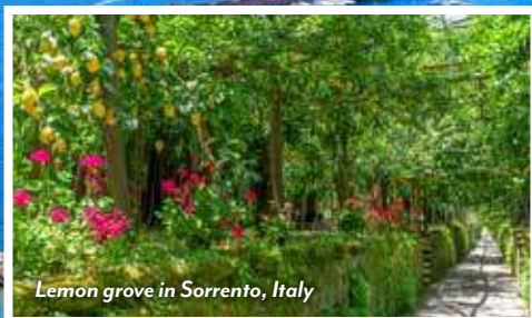
Lemon grove in Sorrento, Italy