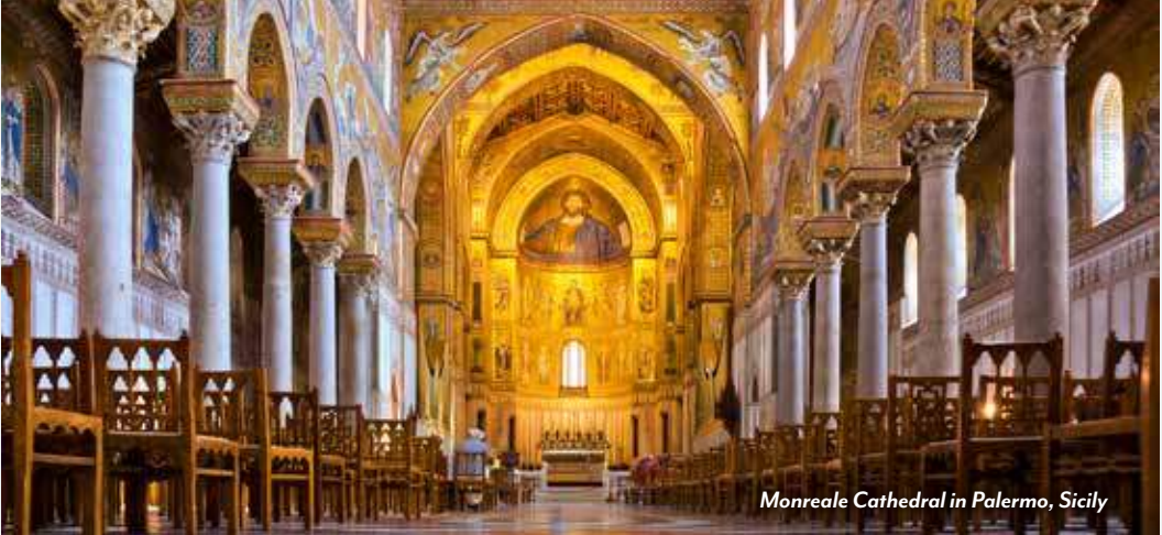
Monreale Cathedral in Palermo, Sicily