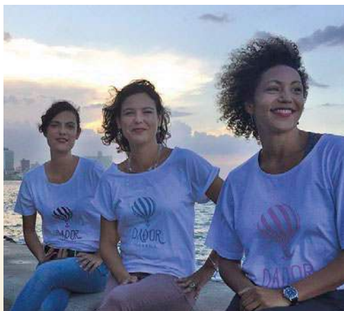
Founders and owners of Dador

Then, visit the historic Hotel Nacional for a tour of the property followed by dinner at a paladar .