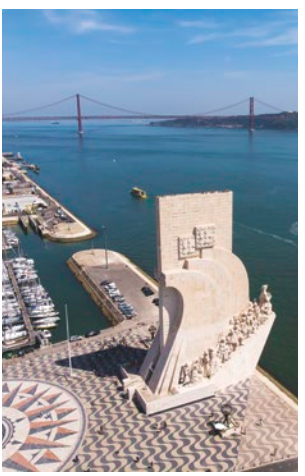
Monument to the Discoveries,