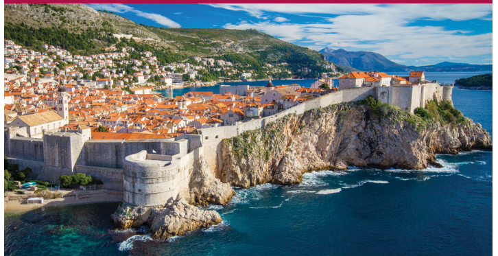
Dubrovnik | 4 days, 2 nights Old Town Tour | Traveler’s Choice Excursion