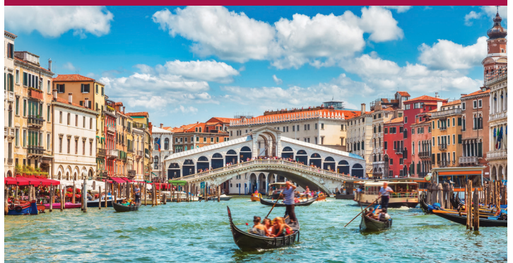
Venice | 3 days, 2 nights Venice Walking Tour | Gondola Ride | Burano