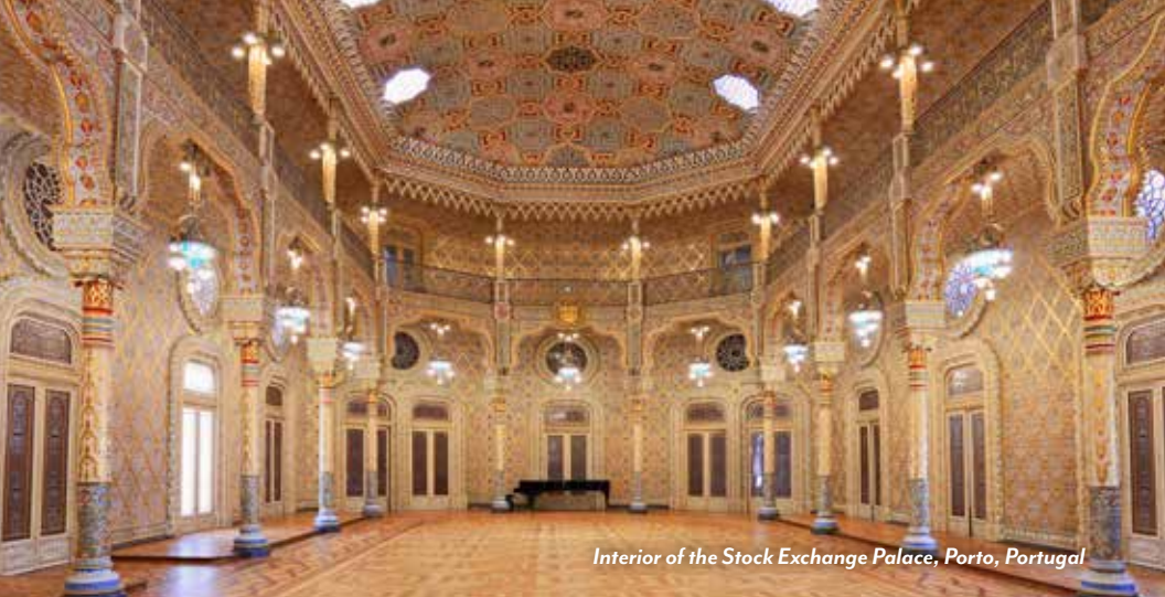
Interior of the Stock Exchange Palace, Porto, Portugal

Heritage-designated Mont-Saint-Michel is a sight of soaring spires isolated beyond a stretch of saltwater marsh.