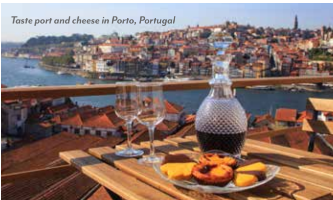
Taste port and cheese in Porto, Portugal

Santiago Calatrava and Philippe Starck redefined the post-industrial skyline. An afternoon excursion in the city will give you two options for included activities. Take a panoramic tour of Bilbao, then choose between touring the Guggenheim's renowned art collection or