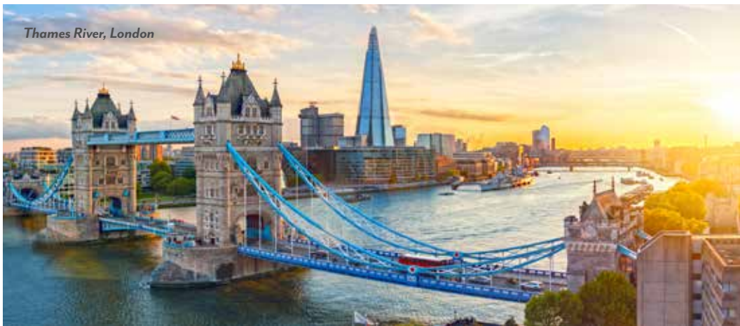
Thames River, London

Following breakfast, disembark and continue to the London Post-Tour Extension or transfer to the airport for your return flight home. (B,L,D)