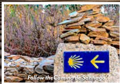
Follow the Camino de Santiago

The mystical story of Santiago de Compostela begins in the ninth century when a hermit named Pelagius reported seeing a field of stars that led him to an ancient tomb containing three bodies — that of Saint James the Great, one of Jesus' apostles, and two of his followers. It is believed that the body of Saint James (also known as Santiago, the patron saint of Spain) was carried to the coast after his death in 44 A.D. and put in a stone boat that was guided by angels to Padrón and then transported to the tomb that Pelagius would be miraculously called to more than 800 years later. Christian pilgrims soon began following the Camino de Santiago pathway to repent for their sins and visit the tomb at Santiago de Compostela. Today, this UNESCO-designated site is one of the most sacred pilgrimage destinations in the world. Your Santiago de Compostela excursion includes a tour of the old town and a visit to the hallowed sanctuary of the martyred saint. Marvel at the Romanesque and Baroque styles in its interior and see the silver urn that contains Saint James' ashes.