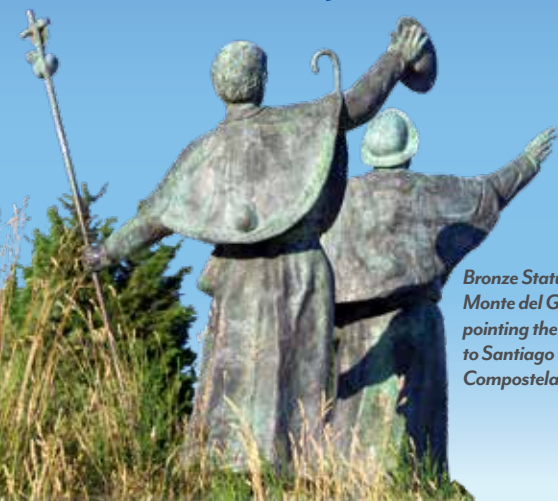
Bronze Statues at Monte del Gozo pointing the way to Santiago de Compostela (right)