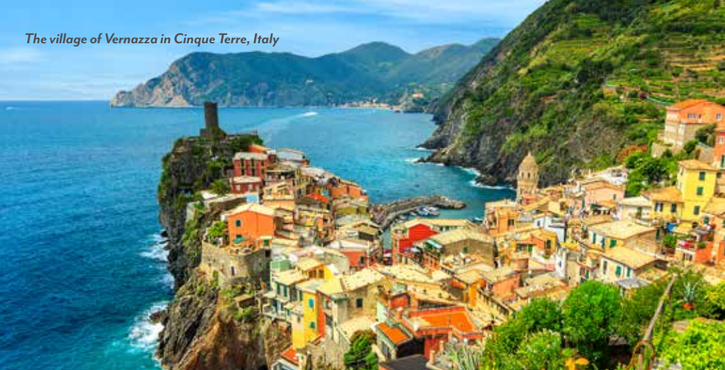
The village of Vernazza in Cinque Terre, Italy