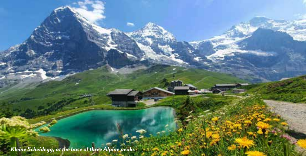
Kleine Scheidegg, at the base of three Alpine peaks

where tanners, millers and fishermen once lived during the Middle Ages. Visit Notre Dame Cathedral, an exquisitely ornamented Gothic beauty. Join the Captain's Welcome Reception and Dinner. (B,L,R,D)