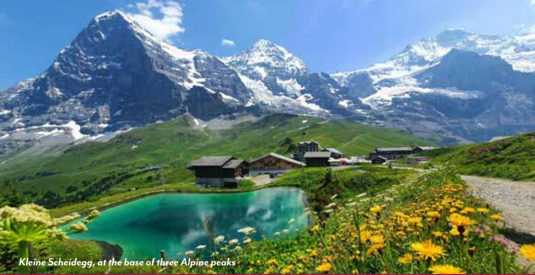
Kleine Scheidegg, at the base of three Alpine peaks

fishermen once lived during the Middle Ages. Visit Notre Dame Cathedral, an exquisitely ornamented Gothic beauty. Join the Captain's Welcome Reception and Dinner. (B,L,R,D)