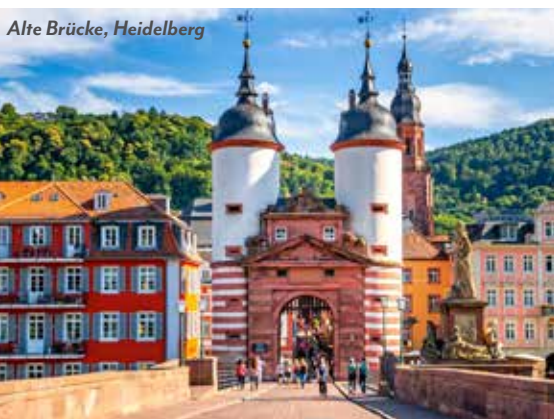
Alte Brücke, Heidelberg