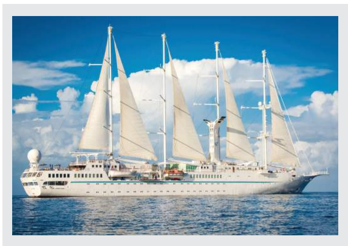
Wind Spirit Exclusively Chartered, Deluxe Small Ship