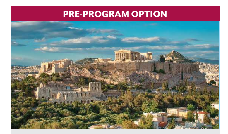
Athens | 4 days, 2 nights City Tour | Acropolis | Cape Sounion