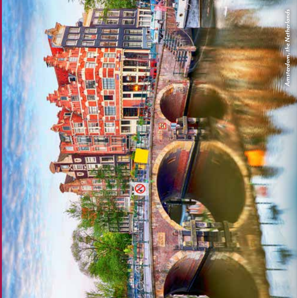
Amsterdam, the Netherlands