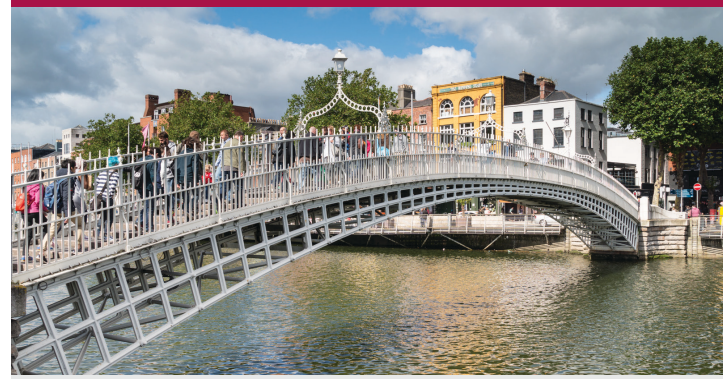
Dublin | 4 days, 3 nights Dublin Tour | County Wicklow | Whiskey Tour