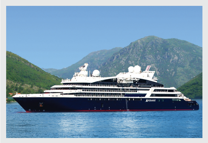
World Voyager Exclusively Chartered, Deluxe Small Ship