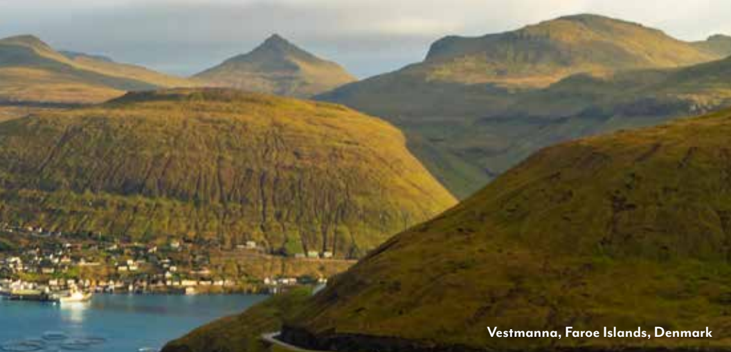
Vestmanna, Faroe Islands, Denmark