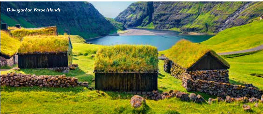
Dúvugarðar, Faroe Islands

Spend today cruising toward Iceland. Enjoy the amenities on the ship, perhaps indulging in a sauna or a dip in the hot tub. Spend some time on deck with a book or watching the horizon. Savor three delicious meals on board. (B,L,D)