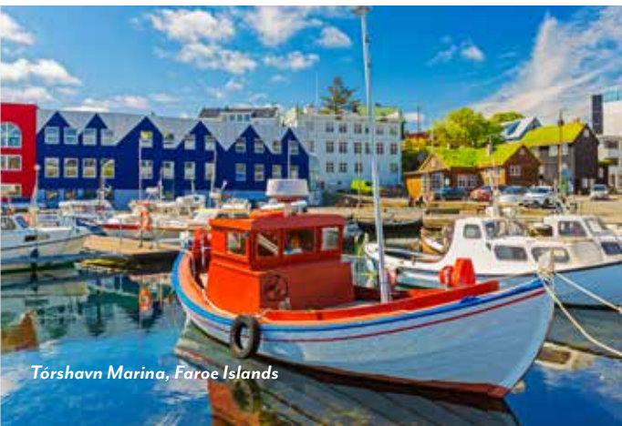
Tórshavn Marina, Faroe Islands

Disembark in Reykjavík and depart for your home city. (B)