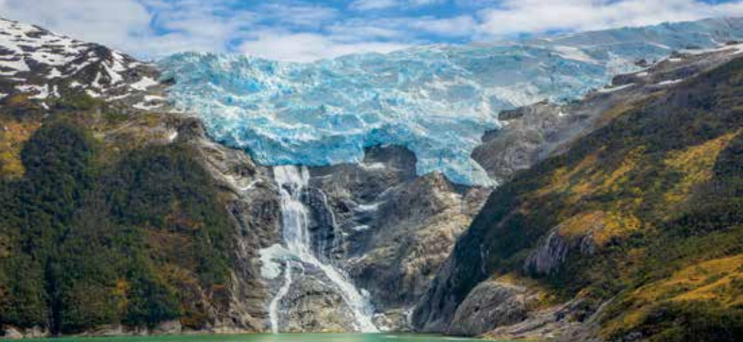
Glacial fjord of the Beagle Channel, Chile

indulge in a traditional lunch and watch a sheep-shearing demonstration at a Patagonian ranch. Continue to Punta Arenas, the gateway to Patagonia and embark the Stella Australis . Gather for a Captain's Welcome Reception and Dinner. (B,L,R,D)