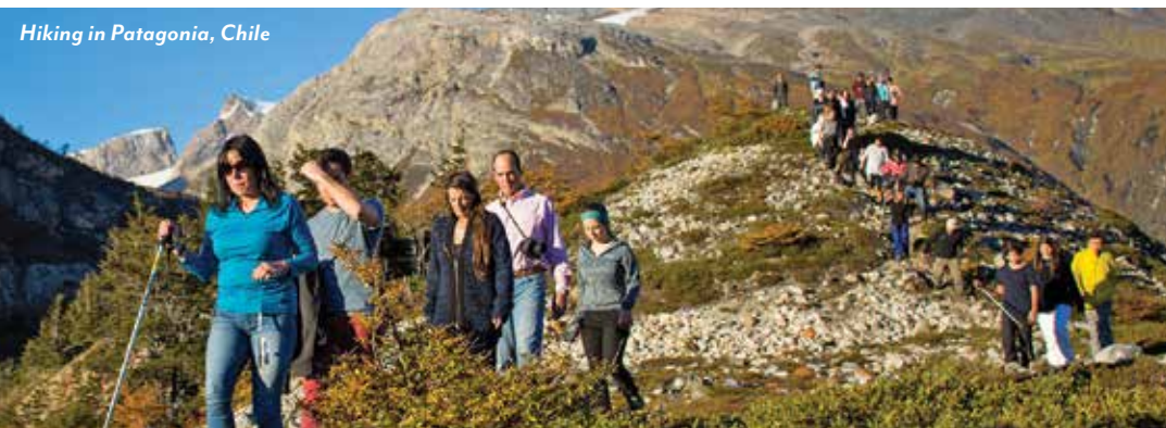
Hiking in Patagonia, Chile