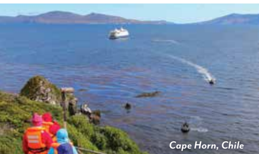
Cape Horn, Chile

While sailing toward Indonesia's fabled Spice Islands in 1520, Portuguese explorer Ferdinand Magellan became the first European to enter the channel that would later bear his name. Along the south side of the strait, amid the world's southernmost forests, smoke rose from numerous native Selk'nam campfires, leading Magellan to name this island Tierra del Humo, "land of smoke," which Spain's King Charles V changed to the more poetic Tierra del Fuego, "land of fire." The northern side of the strait came to be known as Patagonia, "land of giants," for Magellan and his men's impression of the tall, indigenous inhabitants. Three centuries later, the HMS Beagle, under the command of Admiral Robert FitzRoy and with young naturalist Charles Darwin on board, became the first ship to sail east to west through its namesake channel. Experience the same wonder of these intrepid explorers as you cruise through these mesmerizing landscapes almost untouched since Magellan explored them nearly 500 years ago.