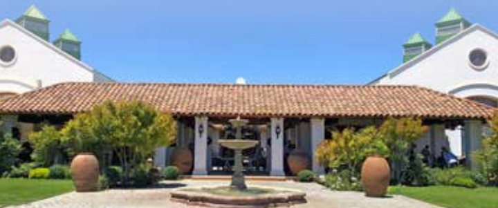
Casas del Bosque Winery, Chile

With Chile's variety of pleasing wines, from classic terroir-driven wines to obscure Marselan grapes and delectable dessert wines, wine debutants and oenophiles alike can sip, savor and return home with excellent memories.