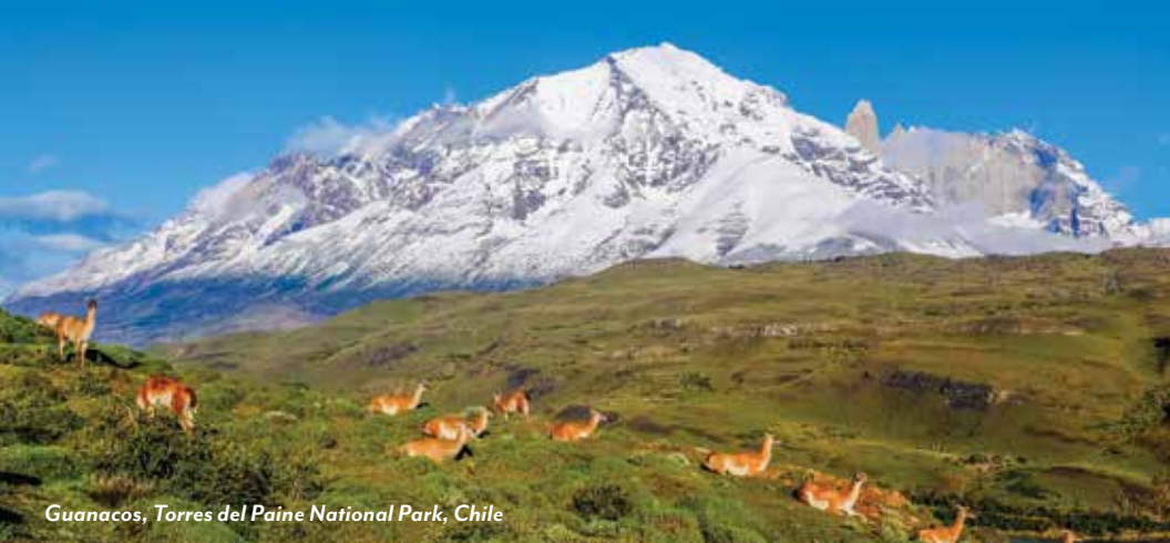
Guanacos, Torres del Paine National Park, Chile