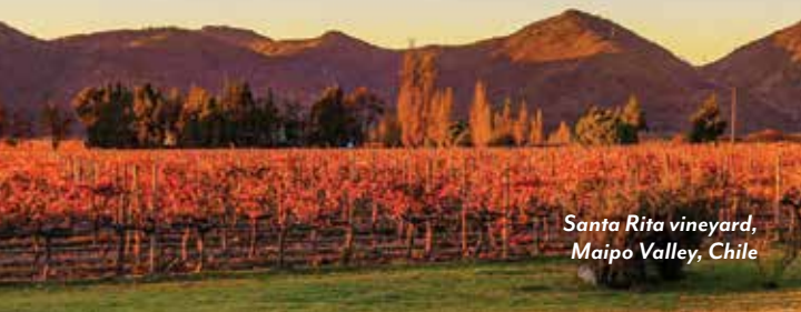
Santa Rita vineyard, Maipo Valley, Chile

With Chile's variety of pleasing wines, from classic terroir-driven wines to obscure Marselan grapes and delectable dessert wines, wine debutants and oenophiles alike can sip, savor and return home with excellent memories.