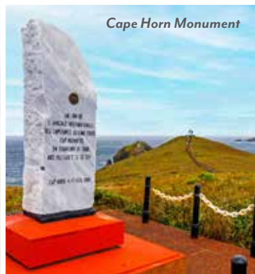
Cape Horn Monument