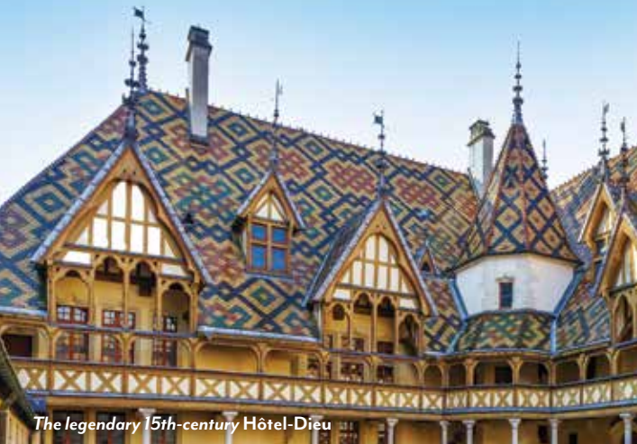
The legendary 15th-century Hôtel-Dieu