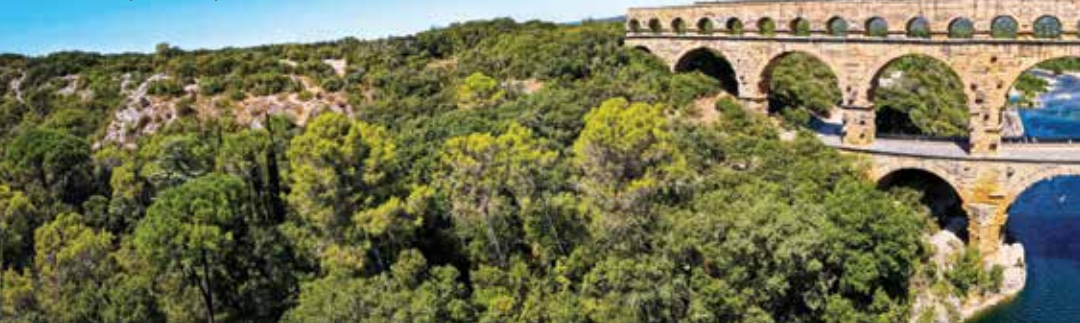
Pont du Gard, Provence, France

Travel to Orange to explore the Roman city's UNESCO World Heritage sites, including a visit to the ancient Roman Theater and a stop to see the Triumphal Arch, built in the late first century as a symbol