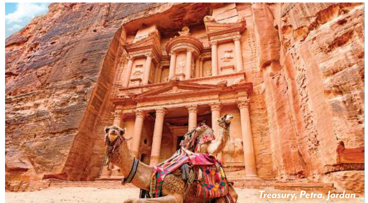
Treasury, Petra, Jordan