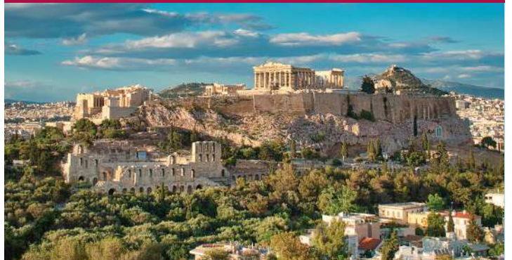
Athens | 3 days, 2 nights Delphi | Acropolis | The Plaka