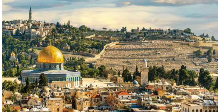
Jerusalem | 6 days, 4 nights Dead Sea | Masada | Bethlehem | Yad Vashem