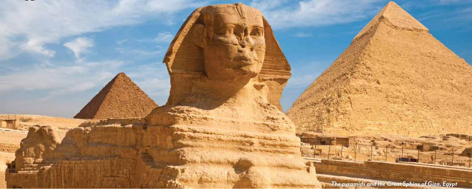
The pyramids and the Great Sphinx of Giza, Egypt