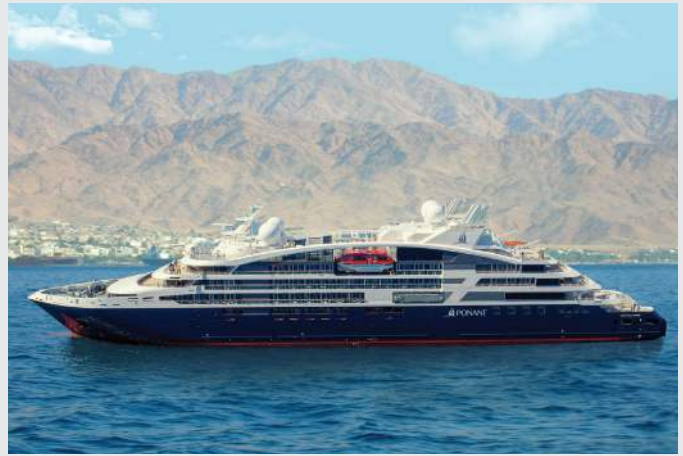
Le Bougainville Exclusively Chartered, Deluxe Small Ship