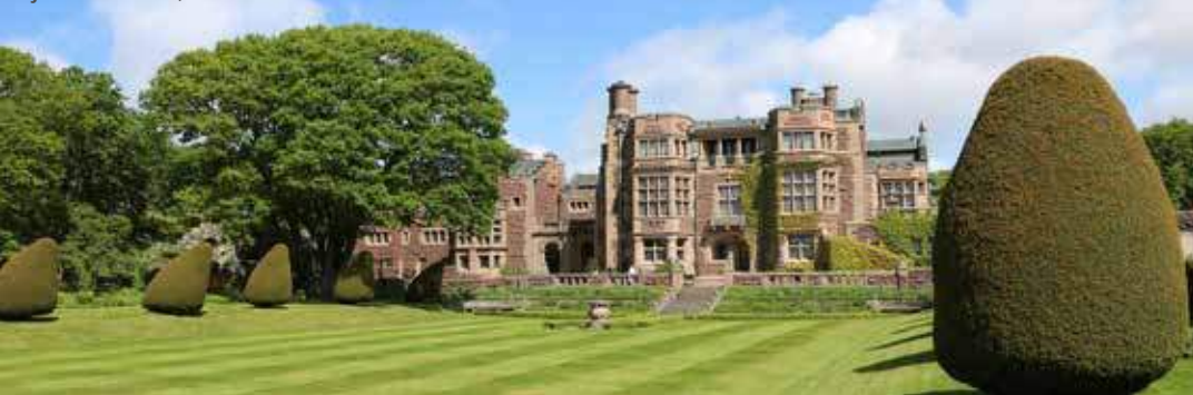
Tjolöholm Castle, Sweden

Klaipėda is a port city with a strong seafaring identity. The old town features German-style, 18th-century wood-framed buildings, winding cobblestone lanes and red-brick warehouses. Unusual statues are a delight to discover throughout the town. Today, choose your included excursion: visit nearby Palanga with its Amber Museum, or venture to the UNESCO-listed Curonian Spit. (B,L,D)