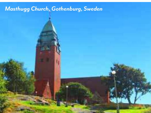
Masthug Church, Gothenburg, Sweden

Following breakfast, disembark and transfer to Stockholm Arlanda Airport for your return flight home. (B)