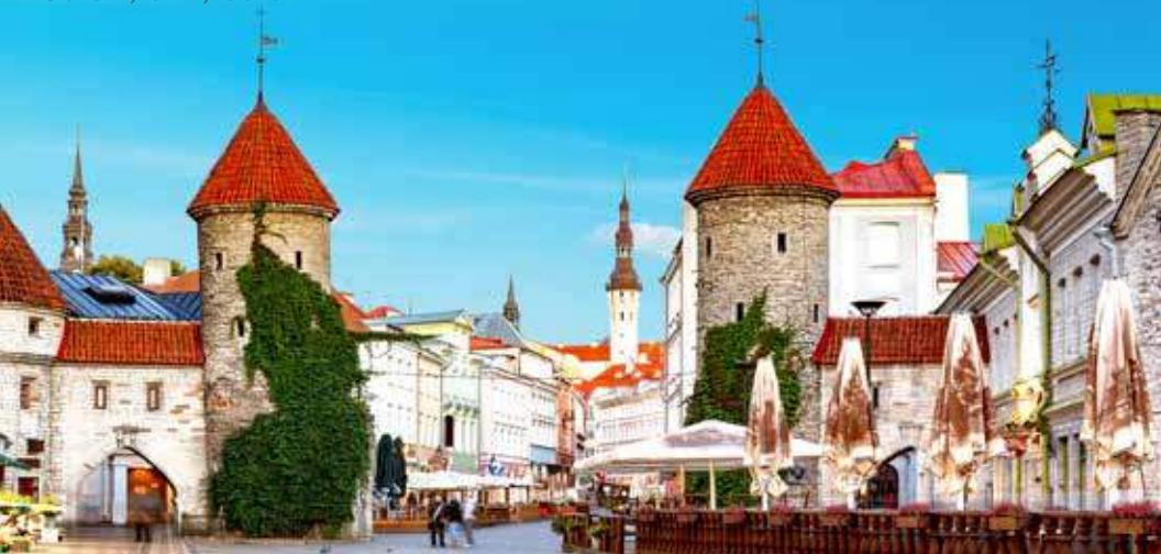
Old Town, Tallinn, Estonia

In his oft-quoted poem, "The Road Not Taken," Robert Frost awakened the idea and determination in many to choose the road less traveled; to overcome fear and avoid regrets. It sparked the quest for adventure in those wishing to experience more from life. Intrepid world travelers manifest this idea by seeking out destinations less traveled, such as Scandinavia and the Baltic Sea, in Northern Europe. Here, travelers have the rare opportunity to visit seven countries and experience a kaleidoscope of cultures in a short period of time, while cruising by ship from port to port. Ancient architecture, centuries-old history, storied landmarks, fascinating cities, and breathtaking, romantic scenery provide the perfect backdrop and opportunity to take the road less traveled, which will surely make all the difference.