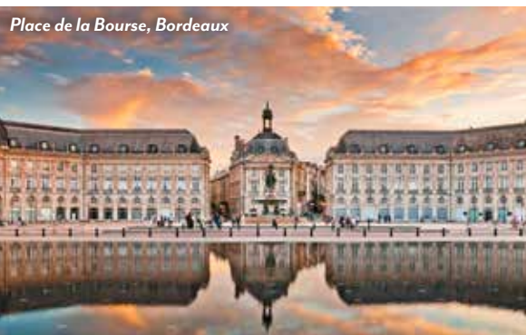
Place de la Bourse, Bordeaux

Day 6 | May 13 | Sep. 30 Stroll through the streets of Sarlat-la-Canéda and see the 16th-century cathedral of Saint Sacerdos and the sublime Romanesque design of the Chapel of the White Penitents. Note the nearby Lanterne des Morts, a bullet-shaped tower said to have been built in 1147, possibly by the Knights Templar. Enjoy a sampling of wine, cheese and other delectable local food before continuing