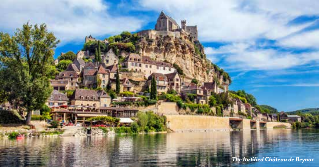
The fortified Château de Beynac