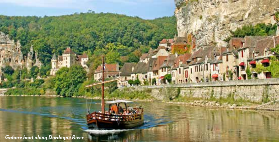
Gabare boat along Dordogne River

to the UNESCO World Heritage-designated Rocamadour.