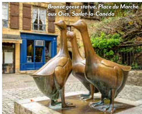
Bronze geese statue, Place du Marché aux Oies, Sarlat-la-Canéda