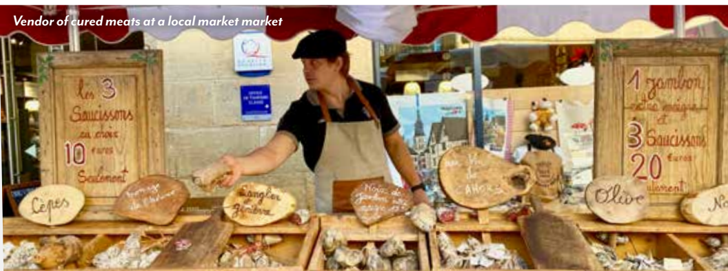
Vendor of cured meats at a local market market

Check out of the hotel after breakfast for your return flight back to your home city. (B)