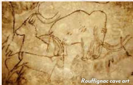
Rouffignac cave art

Rouffignac offers up-close views of over 250 deft prehistoric drawings and paintings that cover a gallery of cavernous walls and ceilings, including the famous friezes of two bison ready to engage each other in battle and 10 mammoths in procession — one of the largest cave paintings ever discovered. Near the village of Les Eyzies, visit the original Cro-Magnon rock shelter and UNESCO World Heritage site of L'Abri de Cap-Blanc, showcasing the rare, life-size frieze of horses and bison sculpted in limestone. An expert-guided tour of the National Museum of Prehistory in Les Eyzies helps put this vast network of prehistoric art into context as we contemplate life at the dawn of humankind.