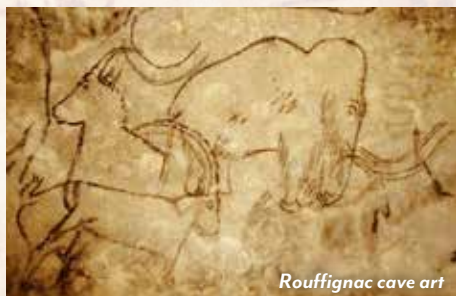
Rouffignac cave art

Rouffignac offers up-close views of over 250 deft prehistoric drawings and paintings that cover a gallery of cavernous walls and ceilings, including the famous friezes of two bison ready to engage each other in battle and 10 mammoths in procession — one of the largest cave paintings ever discovered. Near the village of Les Eyzies, visit the original Cro-Magnon rock shelter and UNESCO World Heritage site of L'Abri de Cap-Blanc, showcasing the rare, life-size frieze of horses and bison sculpted in limestone. An expert-guided tour of the National Museum of Prehistory in Les Eyzies helps put this vast network of prehistoric art into context as we contemplate life at the dawn of humankind.