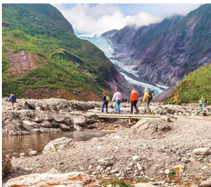
Franz Josef Glacier