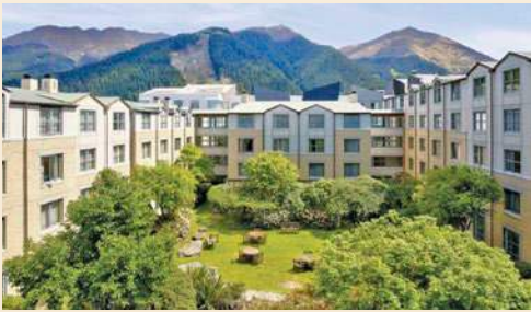
Millennium Hotel Queenstown | Queenstown ○○○○○