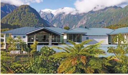
Scenic Hotel Franz Josef Glacier | Franz Josef ○○○○○