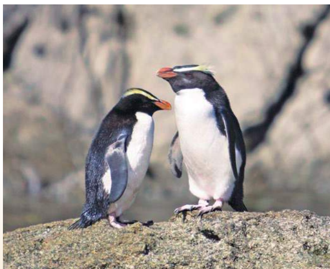
Fiordland crested penguin, Doubtful Sound