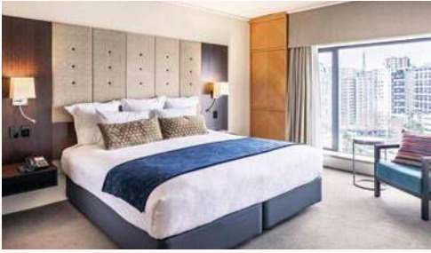
Grand Millennium Auckland | Auckland ○○○○○