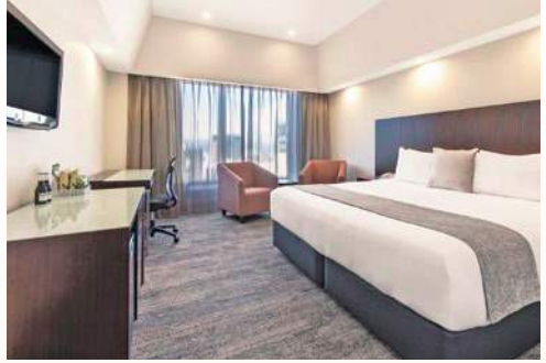
James Cook Hotel Grand Chancellor | Wellington ○○○○○