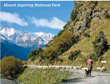
Mount Aspiring National Park