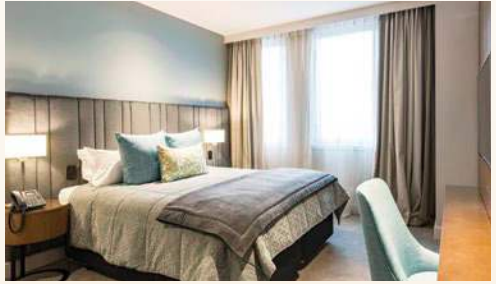
Distinction Christchurch Hotel | Christchurch ○○○○○