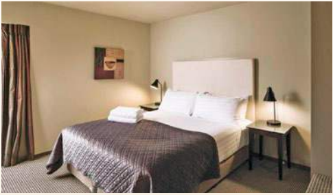
Carnmore Chateau Marlborough | Blenheim ○○○○○