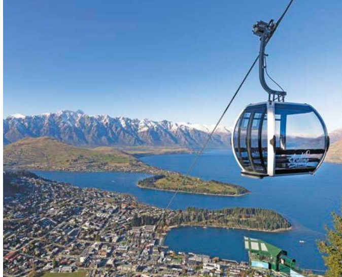
Gondola ride, Queenstown