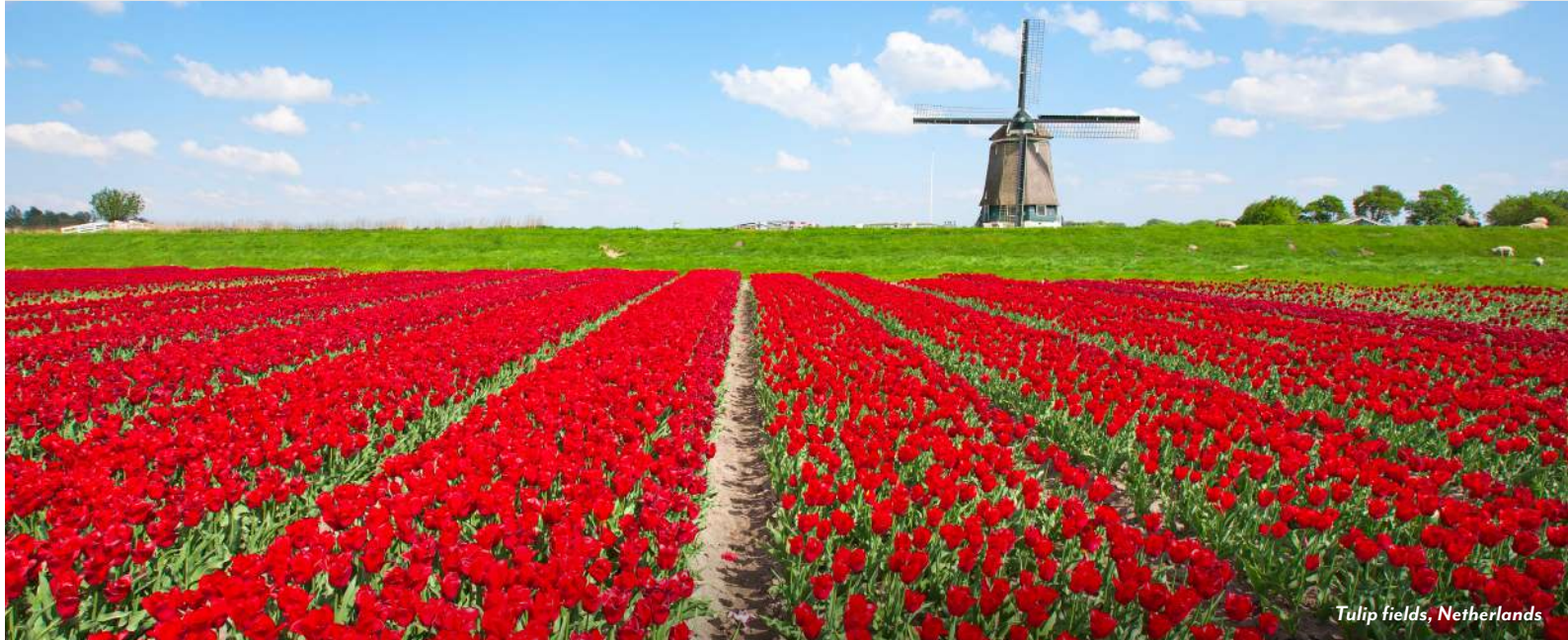
Tulip fields, Netherlands