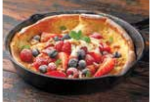
Dutch baby pancake