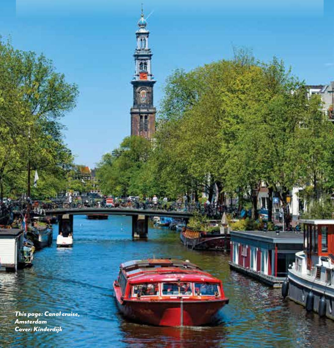
This page: Canal cruise, Amsterdam Cover: Kinderdijk