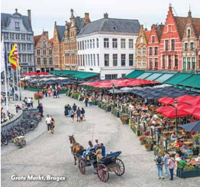
Grote Markt, Bruges