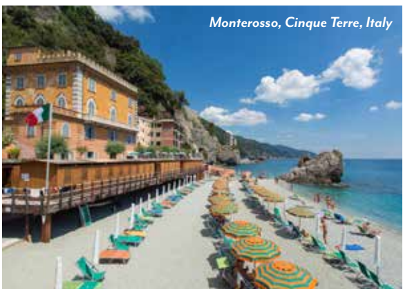
Monterosso, Cinque Terre, Italy

Transfer to the airport after breakfast for your return flight home. (B)