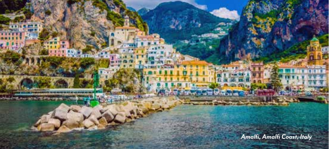
Amalfi, Amalfi Coast, Italy