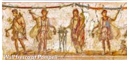
Wall fresco at Pompeii

Famously located in the shadow of the Mount Vesuvius volcano, the ancient city of Pompeii first rose to prominence in the eighth century B.C. as a Hellenistic center of Greek culture. By the time Vesuvius erupted in 79 A.D., the influence of nearby Rome had turned the wealthy coastal city into a resort for some of the Roman Empire's most elite citizens — featuring luxurious villas, open-air squares, bath houses and a 20,000-seat amphitheater. On the fateful August day that tephra from Vesuvius buried the city under a shroud of volcanic ash, an estimated 2,000 people perished beneath it. Pompeii and those who died in the city remained entombed for nearly 17 centuries. The petrified city was discovered in 1748 by explorers who found it astoundingly frozen in time, preserved by the volcanic ash that destroyed it.