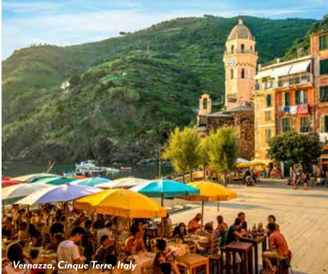
Vernazza, Cinque Terre, Italy