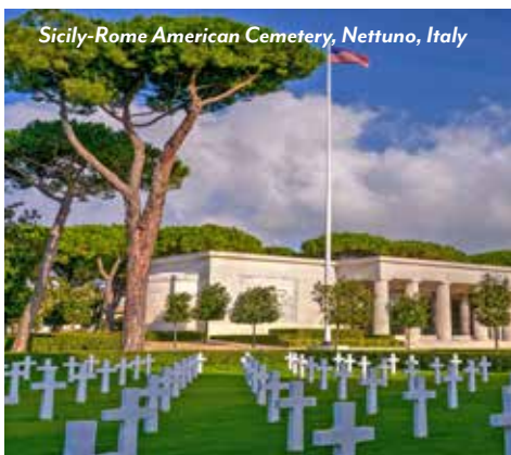
Sicily-Rome American Cemetery, Nettuno, Italy