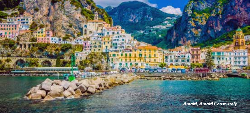
Amalfi, Amalfi Coast, Italy