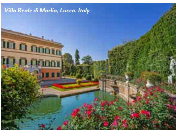
Villa Reale di Marlia, Lucca, Italy

Enjoy breakfast with views of Sorrento, an outpost of the ancient Roman Republic and the scenic gateway to Mount Vesuvius and Pompeii. Explore the ancient petrified city of Pompeii on foot to see the wealthy Vetti family estate and the extraordinary amphitheater — the earliest surviving stone amphitheater of the Roman world — and Temple of Jupiter.