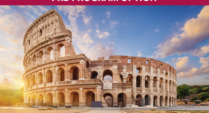
Rome | 5 days, 3 nights The Colosseum | Vatican City | Spanish Steps