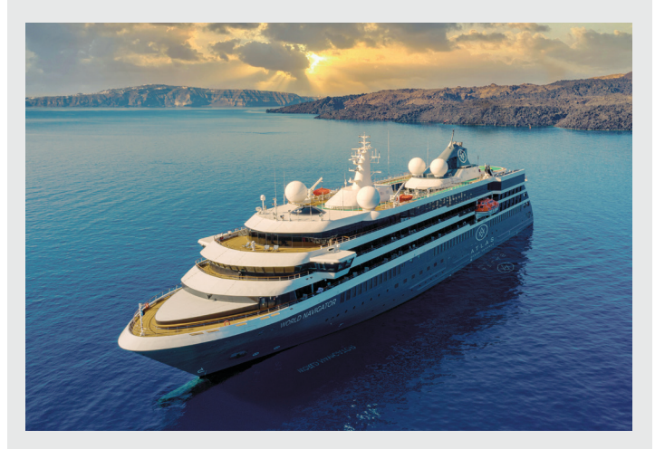
World Navigator Exclusively Chartered, Deluxe Small Ship